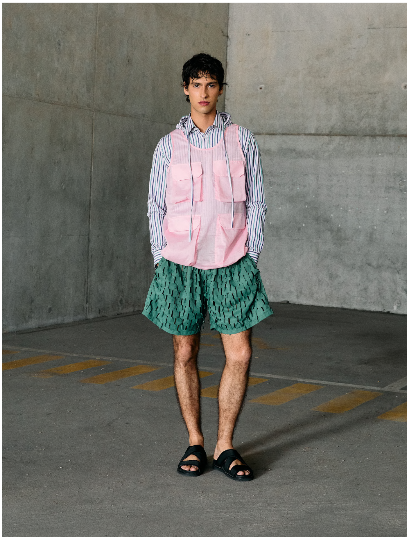
Singlet | DCASS27-SINGLETO3 | Pink Shirt | DCSS27-SHIRT01 | Pink / Marine / Green / White Shorts | DCSS27-SWIMWEAR01 | Green Sandals | DCSS27-SHOES01 | Black