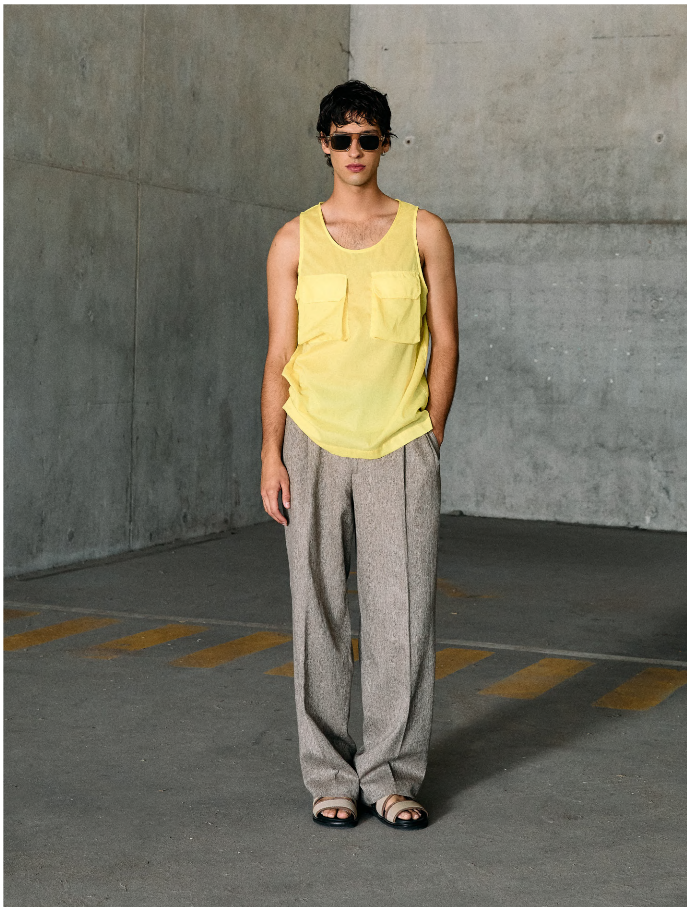
Glasses | DCSS27-GLASSES01 | Beige Singlet | DCASS27-SINGLETO3 | Yellow Trousers | DCSS27-TROUSERS02 | Stone Sandals | DCSS27-SHOES01 | Beige