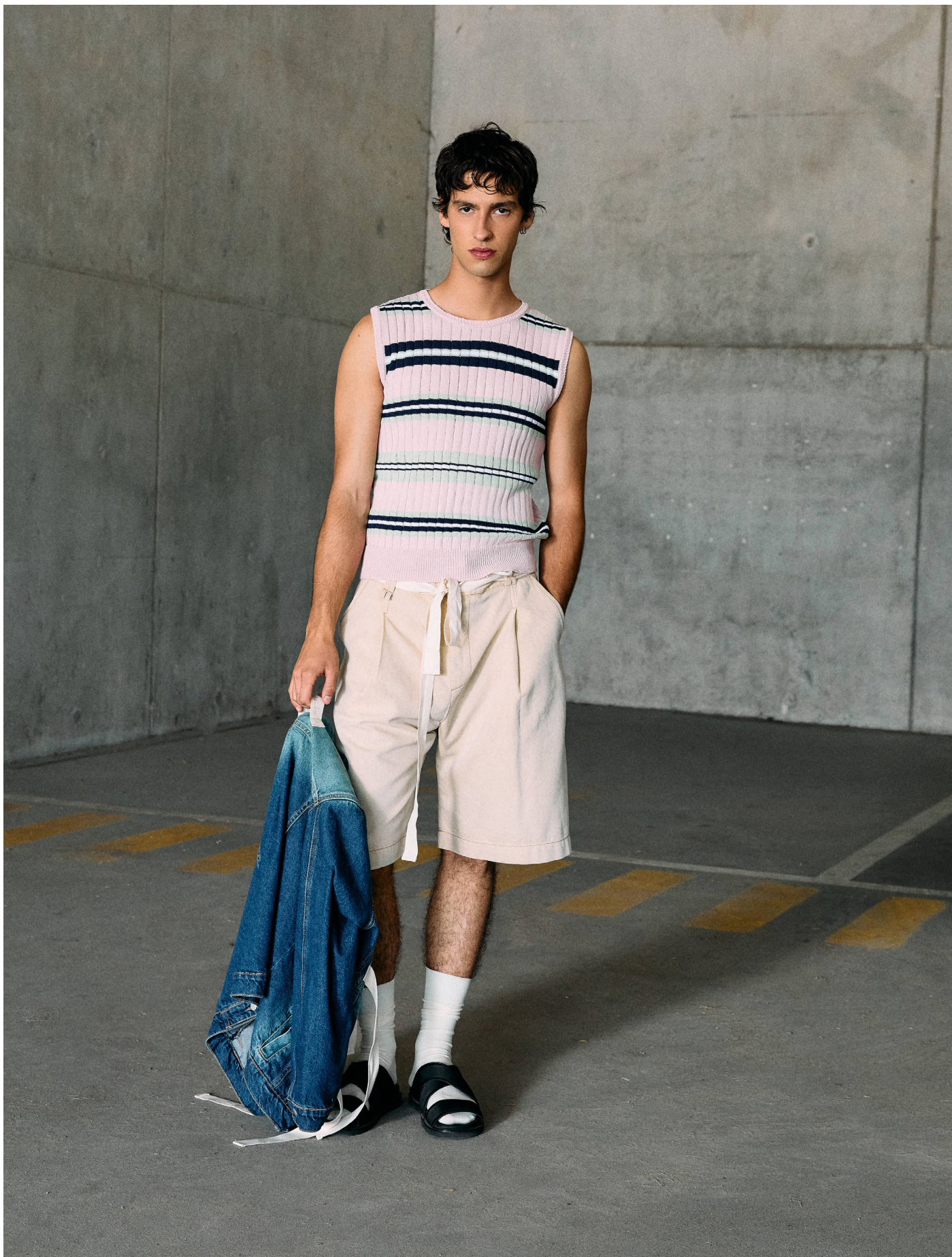
Trucker | DCSS27- OUTWEAR-JEANS03 | Marine Vest | DCSS27-KNITWEAR04 | Pink / Marine / Green / White Shorts | DCASS27-SHORT-JEANS09 | Beige Sandals | DCSS27-SHOES01 | Black