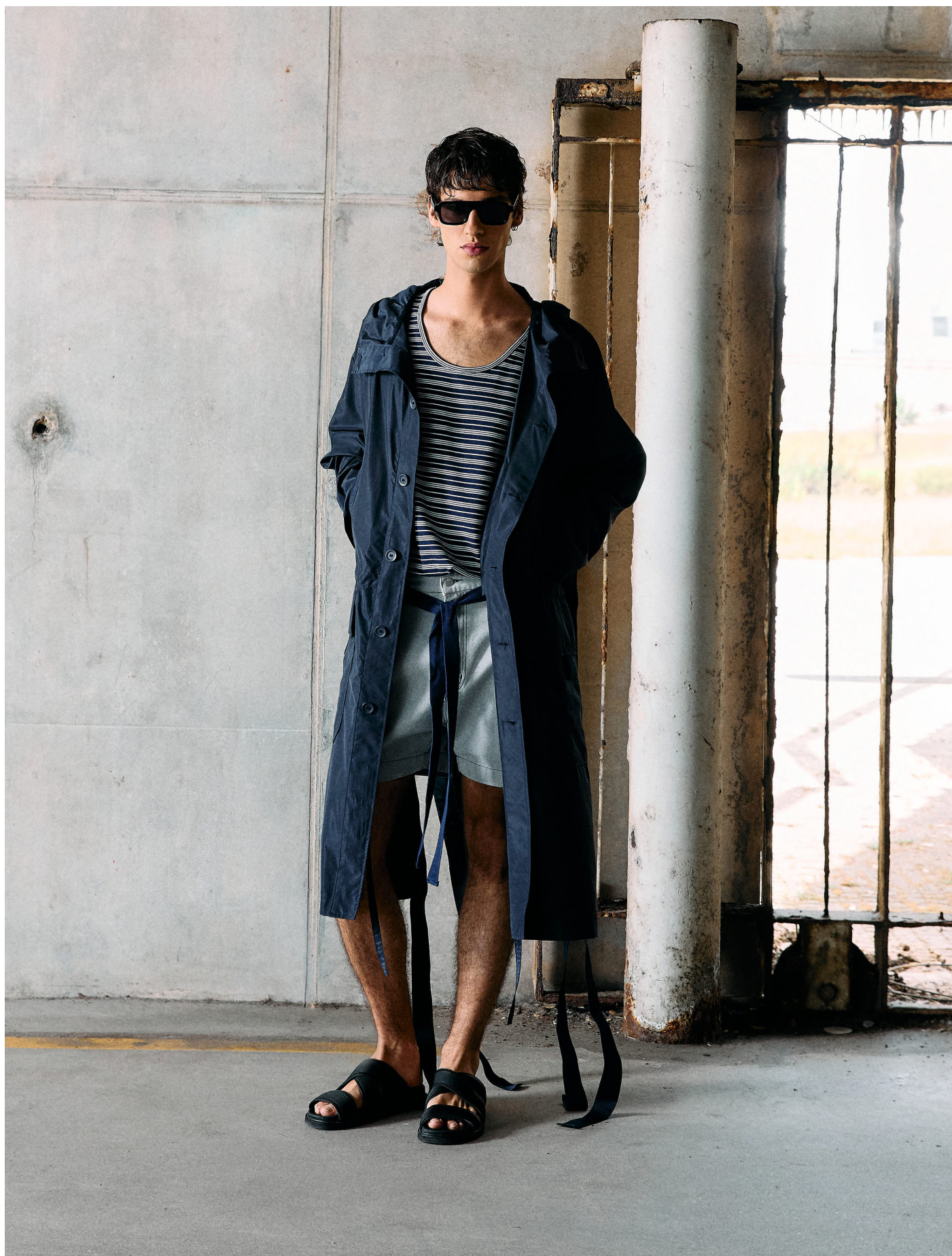
Glasses | DCSS27-GLASSES01 | Black Parka | DCSS27-PARKA02 | Marine Singlet | DCASS27-SINGLET11 | Marine / White Shorts | DCASS27-SHORT-JEANS07 | Blue Sandals | DCSS27-SHOES01 | Black