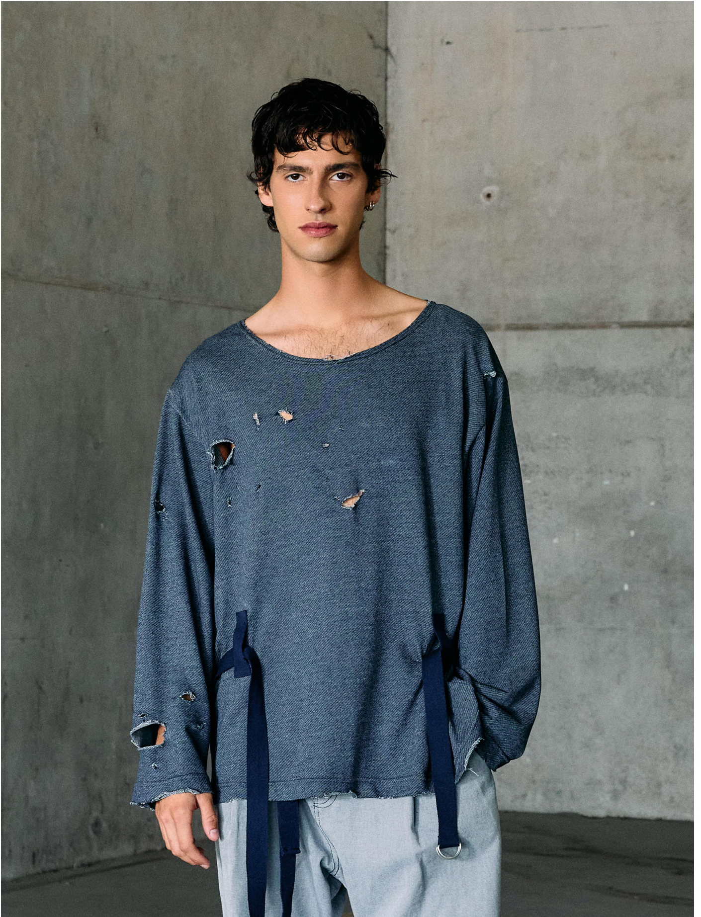
Long-sleeve | DCSS27-LONG-SLEEVE01 | Denim Blue Jeans | DCSS27-JEANS08 | Blue