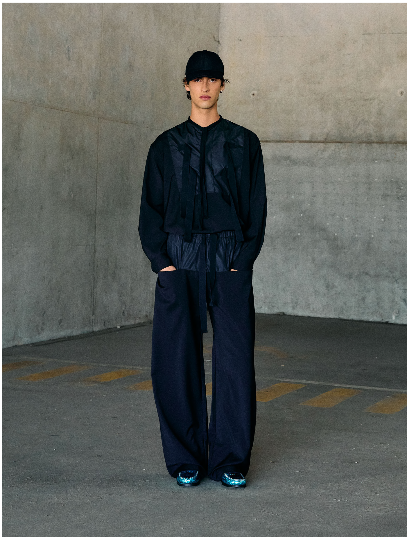
Cap | DCSS27-CAP02 | Marine Sweatshirt | DCSS27-SWEATSHIRT01 | Marine Trousers | DCSS27-TROUSERS05 | Marine Moccassins| DCSS27-SHOES02 | Holo Blue