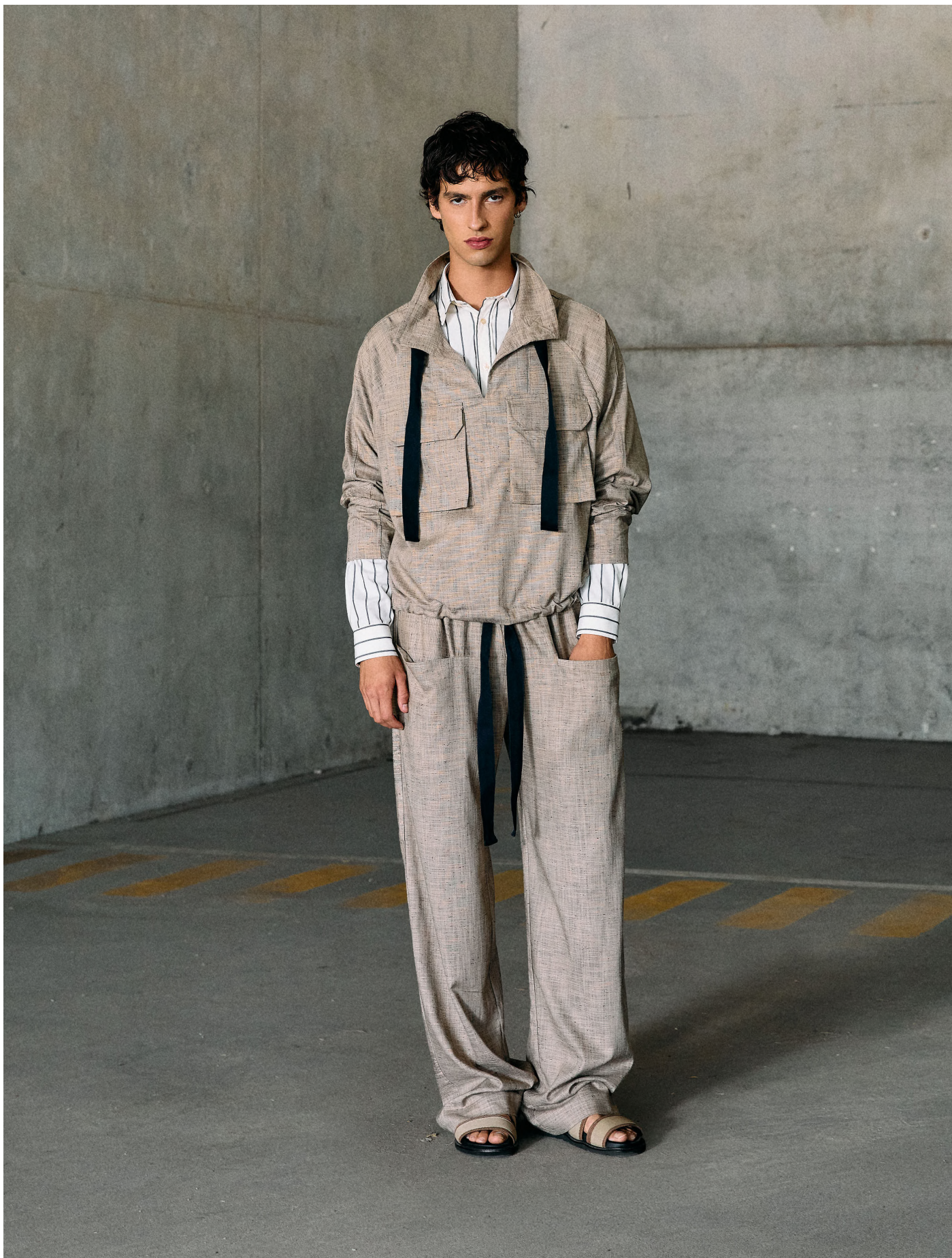
Popover | DCSS27-OUTWEAR04 | Stone / Marine Shirt | DCSS27-SHIRT05 | Cream / Black Trousers | DCSS27-TROUSERS06 | Stone / Marine Sandals | DCSS27-SHOES01 | Beige