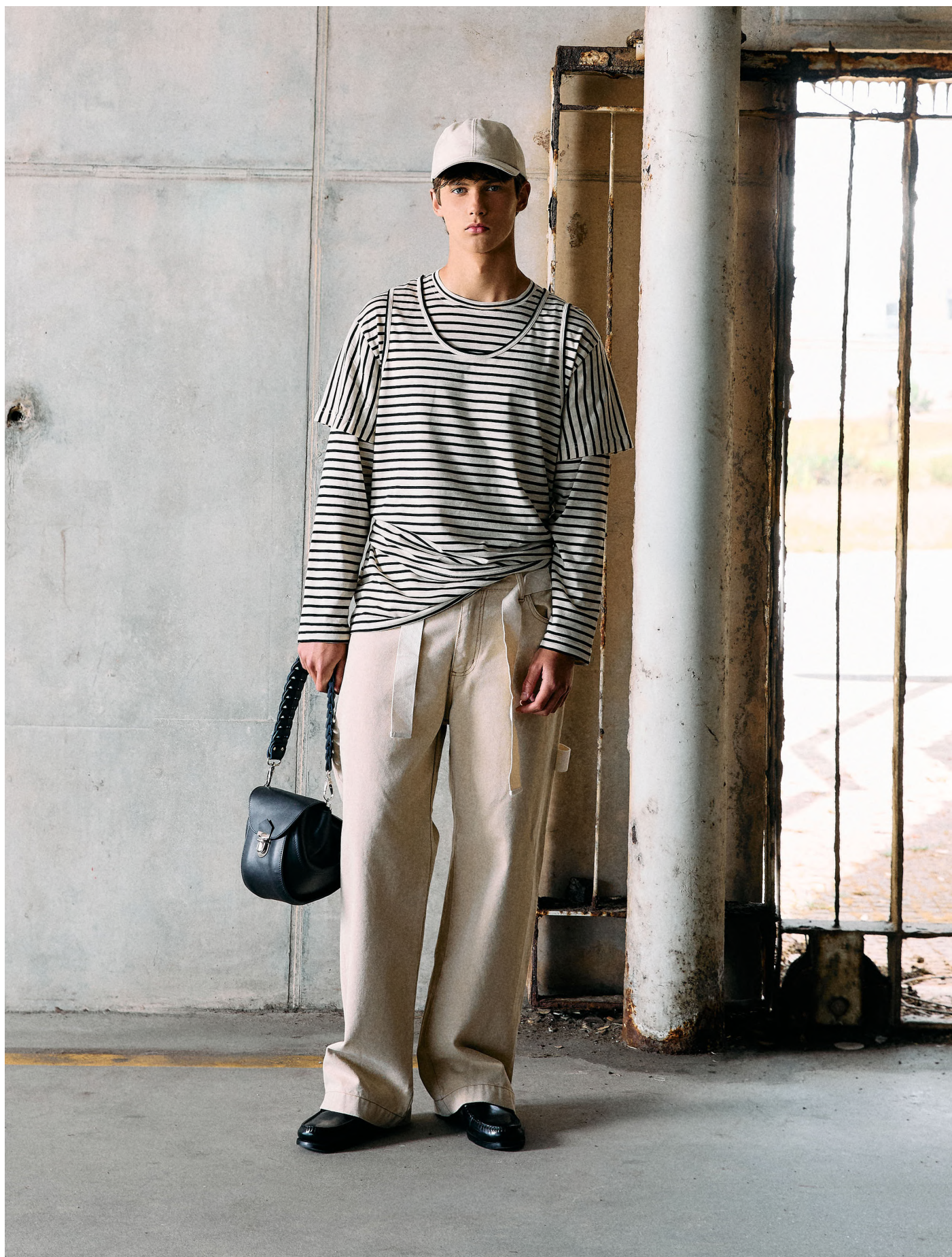
Cap | DCSS27-CAP01 | Beige Singlet | DCASS27-SINGLET10 | Beige /Black T-shirt | DCSS27-T-SHIRT02 | Beige /Black Jeans | DCSS27-JEANS06 | Beige Moccassins | DCSS27-SHOES03 | Black