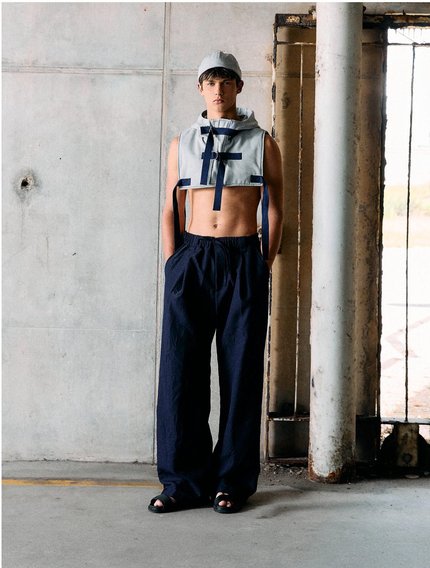
Sailor Cap | DCSS27-SAILORCAPO3 | Blue Vest | DCSS27-VEST03 | Blue Trousers | DCSS27-TROUSERS03 | Marine Sandals | DCSS27-SHOES01 | Black