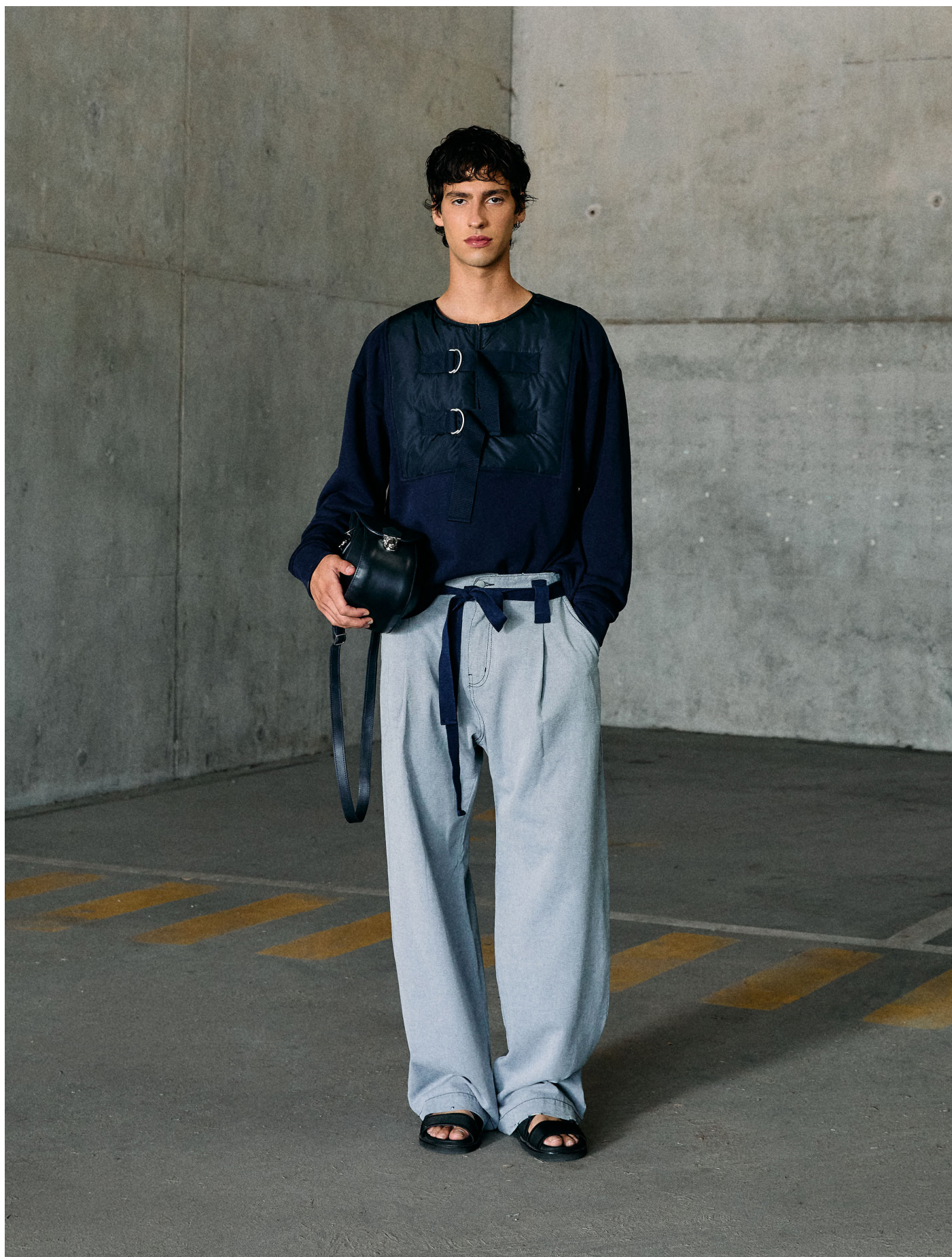
Sweatshirt | DCSS27-SWEATSHIRTO1 | Marine Pleated Jeans | DCSS27-JEANS08 | Blue Bag | DCSS27-BAG01 | Marine Sandals | DCSS27-SHOES01 | Black