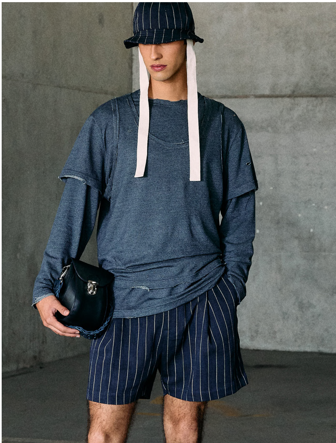
Hat | DCSS27-HAT02 | Marine / Beige Singlet | DCASS27-SINGLETO8 | Denim Blue T-shirt | DCSS27-T-SHIRT01 | Denim Blue Shorts | DCASS27-SHORT05 | Marine / Beige Bag | DCSS27-BAG01 | Marine