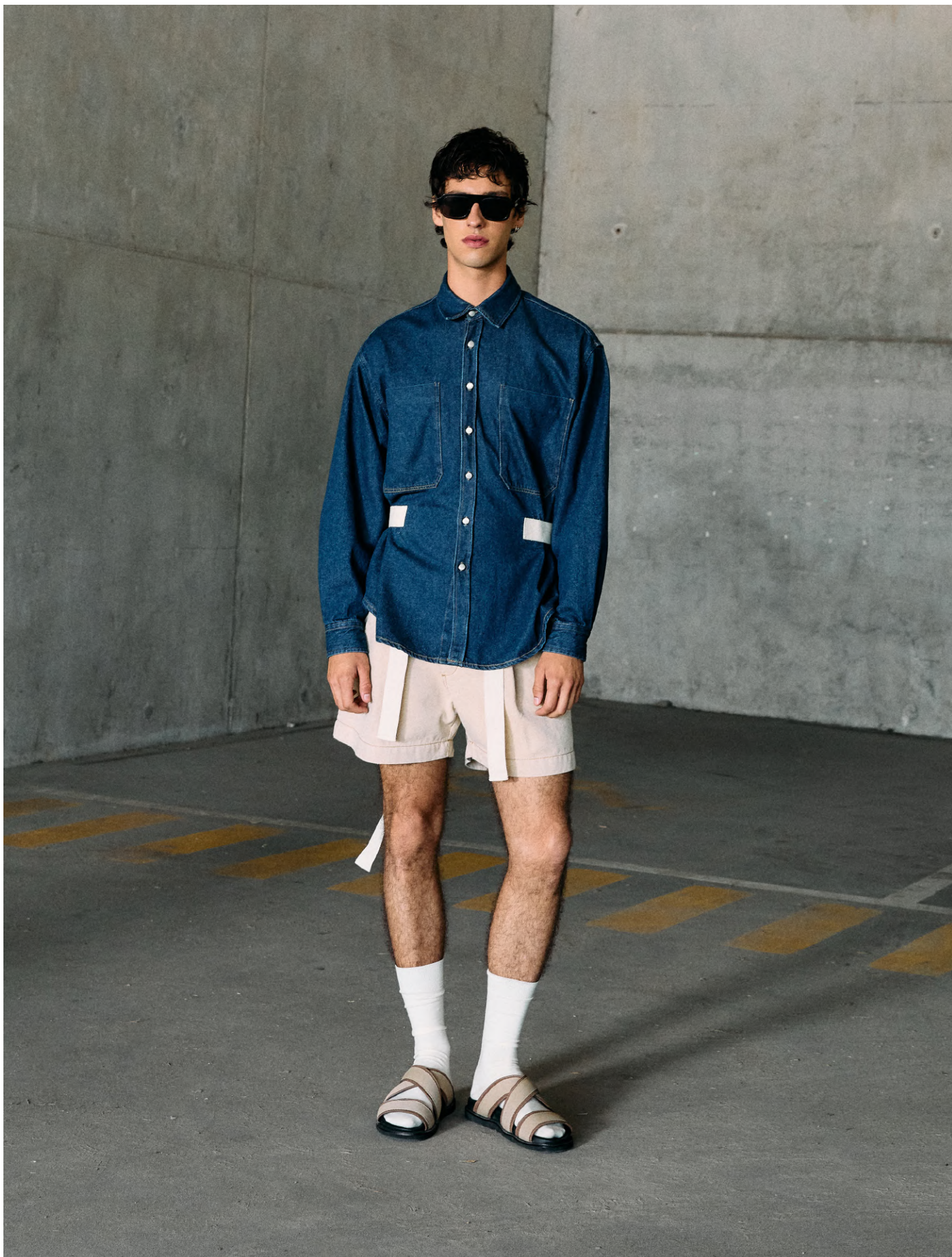
Glasses | DCSS27-GLASSES01 | Black Overshirt | DCSS27-OVERSHIRT-JEANS03 | Dirty Blue Shorts | DCASS27-SHORT-JEANS08 | Beige Sandals | DCSS27-SHOES01 | Beige