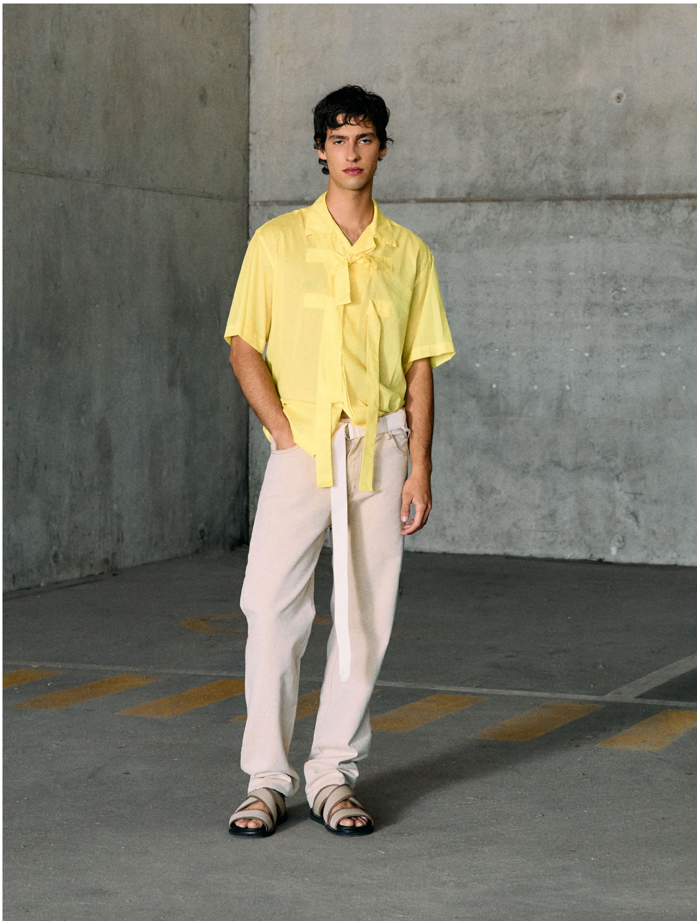
Shirt | DCSS27-SHIRT09 | Yellow Jeans | DCSS27-JEANS03 | Beige Sandals | DCSS27-SHOES01 | Beige