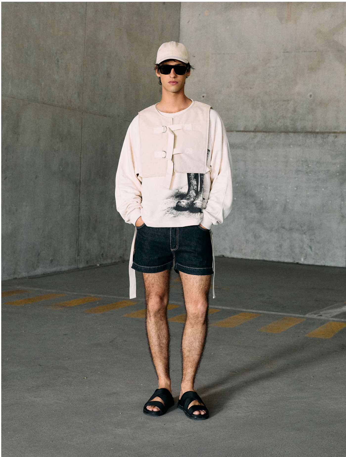
Cap | DCSS27-CAP01 | Beige Glasses | DCSS27-GLASSES01 | Black Vest | DCSS27-VEST01 | Beige Sweatshirt | DCSS27-SWEATSHIRTO4 | Ecrú Shorts | DCASS27-SHORT-JEANSO1 | Black Sandals | DCSS27-SHOES01 | Black