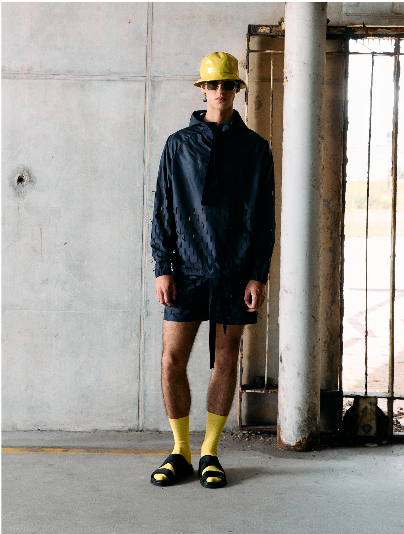
Hat | DCSS27-HAT01 | Yellow Iris Glasses | DCSS27-GLASSES01 | Black Popover | DCSS27-OUTWEAR01 | Marine Shorts | DCSS27-SWIMWEAR02 | Marine Sandals | DCSS27-SHOES01 | Black