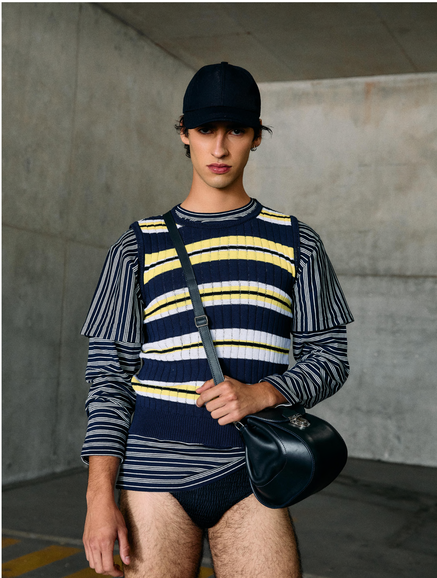
Cap | DCSS27-CAP02 | Marine Vest | DCSS27-KNITWEAR01 | Marine / Yellow / Black / White T-shirt | DCSS27-T-SHIRT03 | Marine / White Swim Trunks | DCSS27-SWIMWEAR03 | Marine