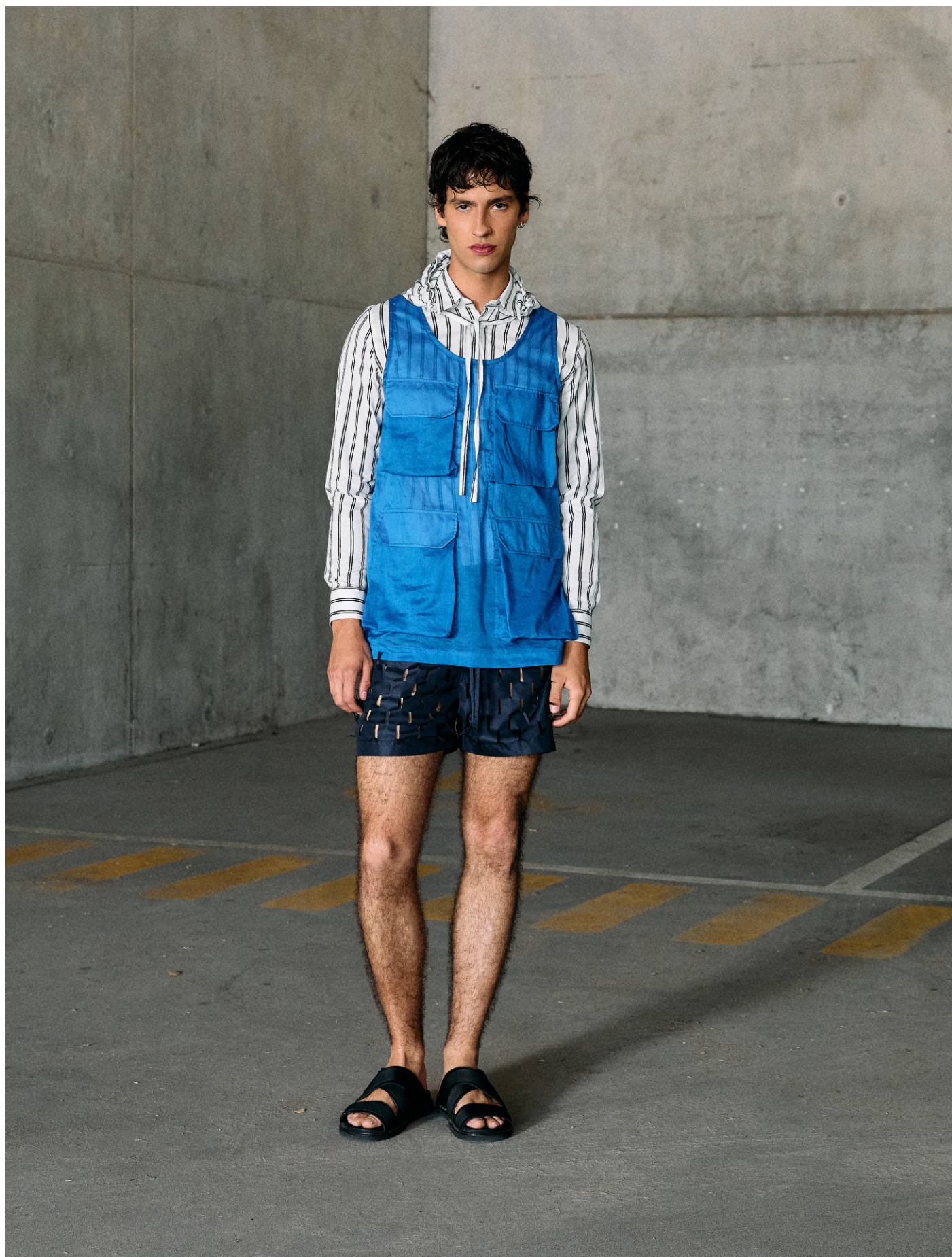
Singlet | DCASS27-SINGLETO3 | Royal Blue Shirt | DCSS27-SHIRT01 | White / Black / Blue Shorts | DCSS27-SWIMWEAR02 | Marine Sandals | DCSS27-SHOES01 | Black