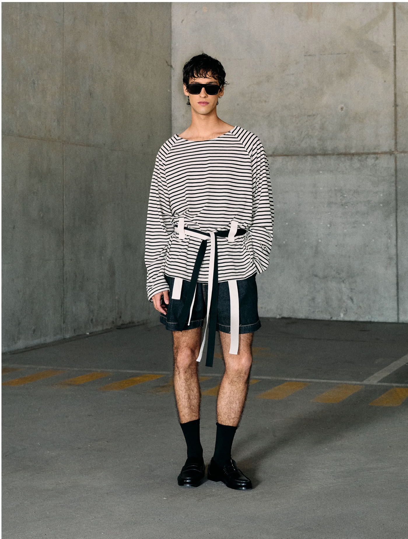
Glasses | DCSS27-GLASSES01 | Black Long-Sleeve | DCSS27-LONG-SLEEVE02 | Beige / Black Shorts | DCASS27-SHORT-JEANS07 | Black Moccassins| DCSS27-SHOES03 | Black