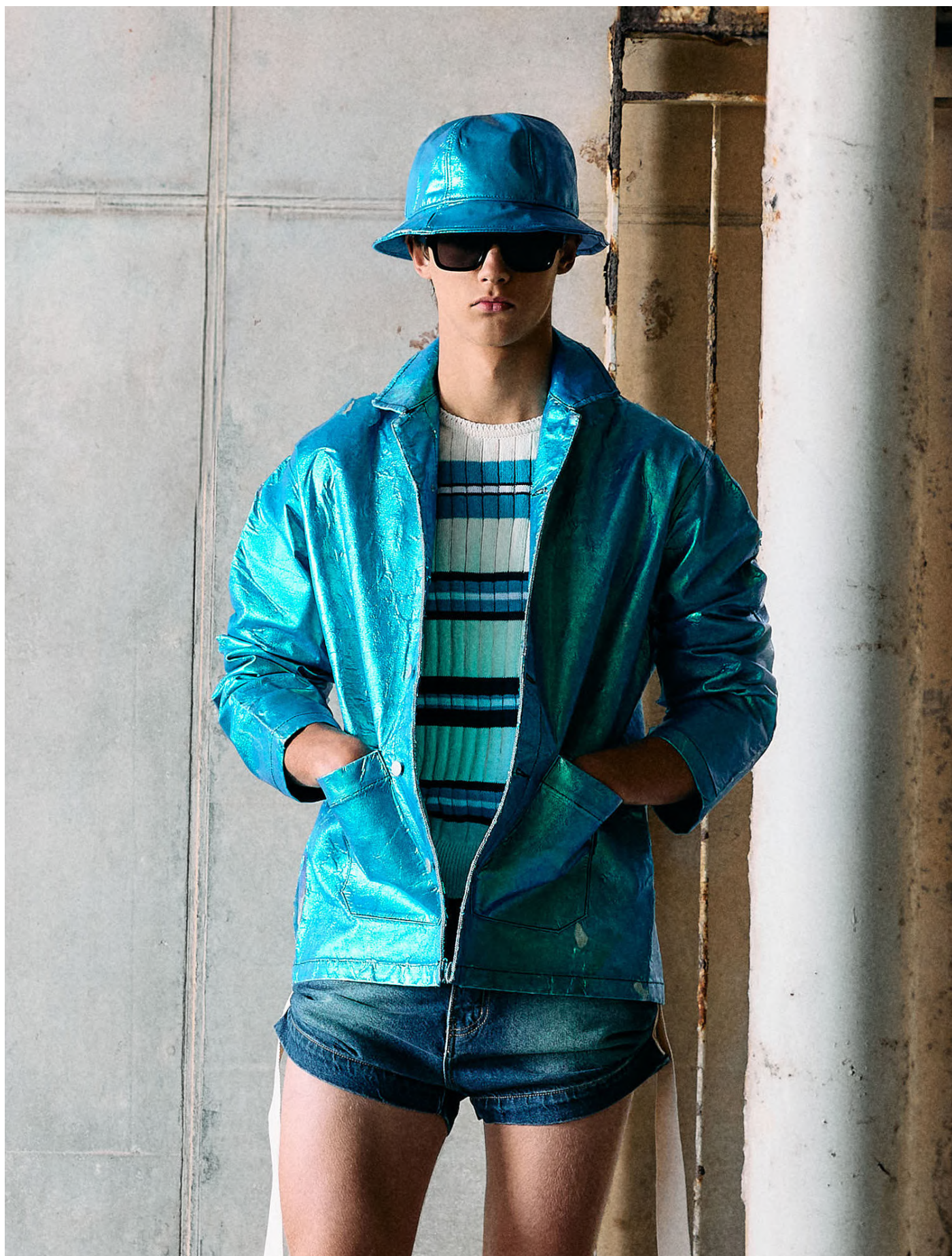
Hat | DCSS27-HAT01 | Iris Blue Glasses | DCSS27-GLASSES01 | Black Overshirt | DCSS27-OVERSHIRT-JEANS01 | Iris Blue T-shirt | DCSS27-KNITWEAR05 | Ecru / Blue / Black / White Shorts | DCASS27-SHORT-JEANS02 Dirty Blue