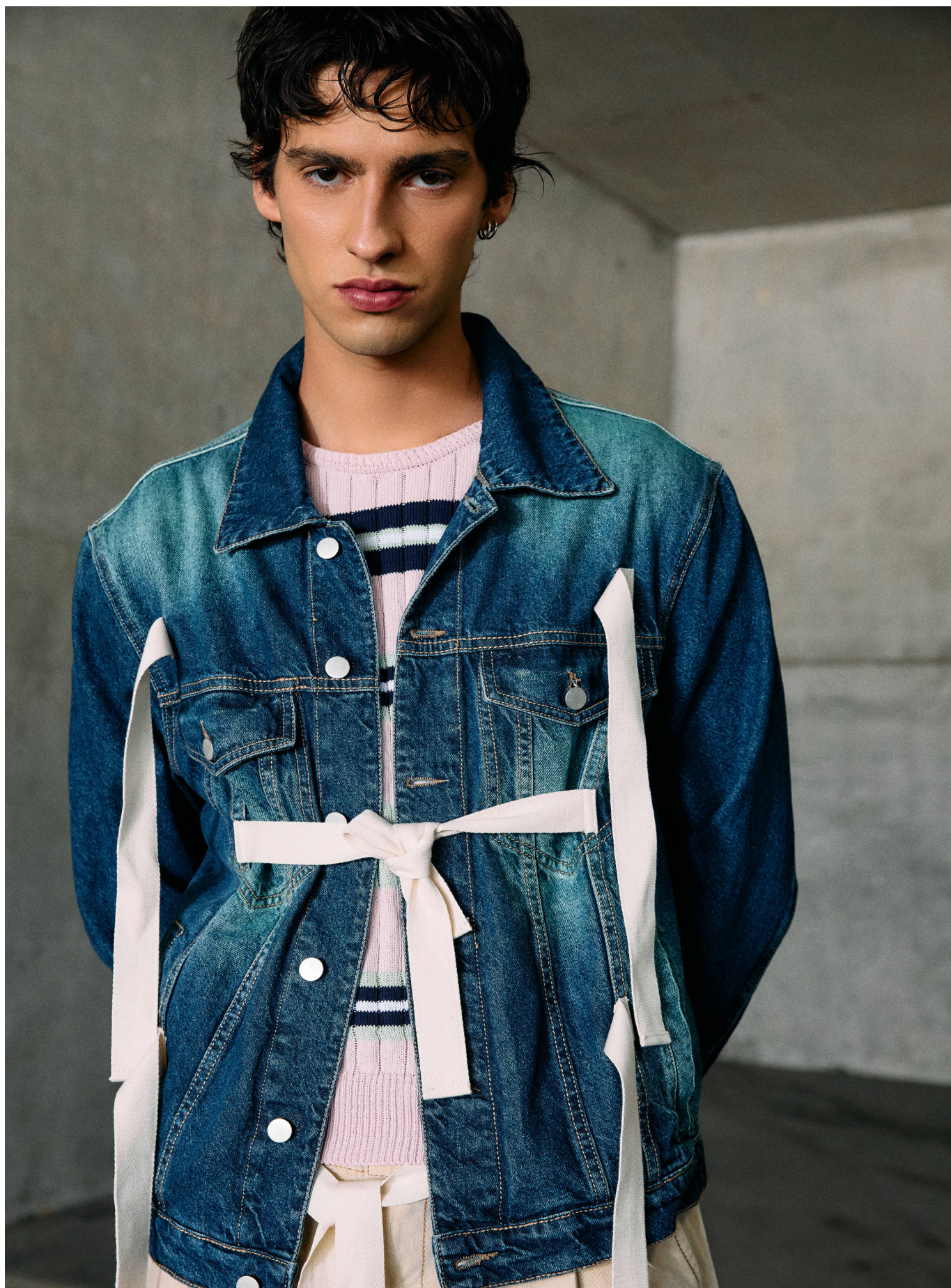
Trucker | DCSS27-OUTWEAR-JEANS03 | Marine Vest | DCSS27-KNITWEAR04 | Pink / Marine / Green / White Shorts | DCASS27-SHORT-JEANS09 | Beige