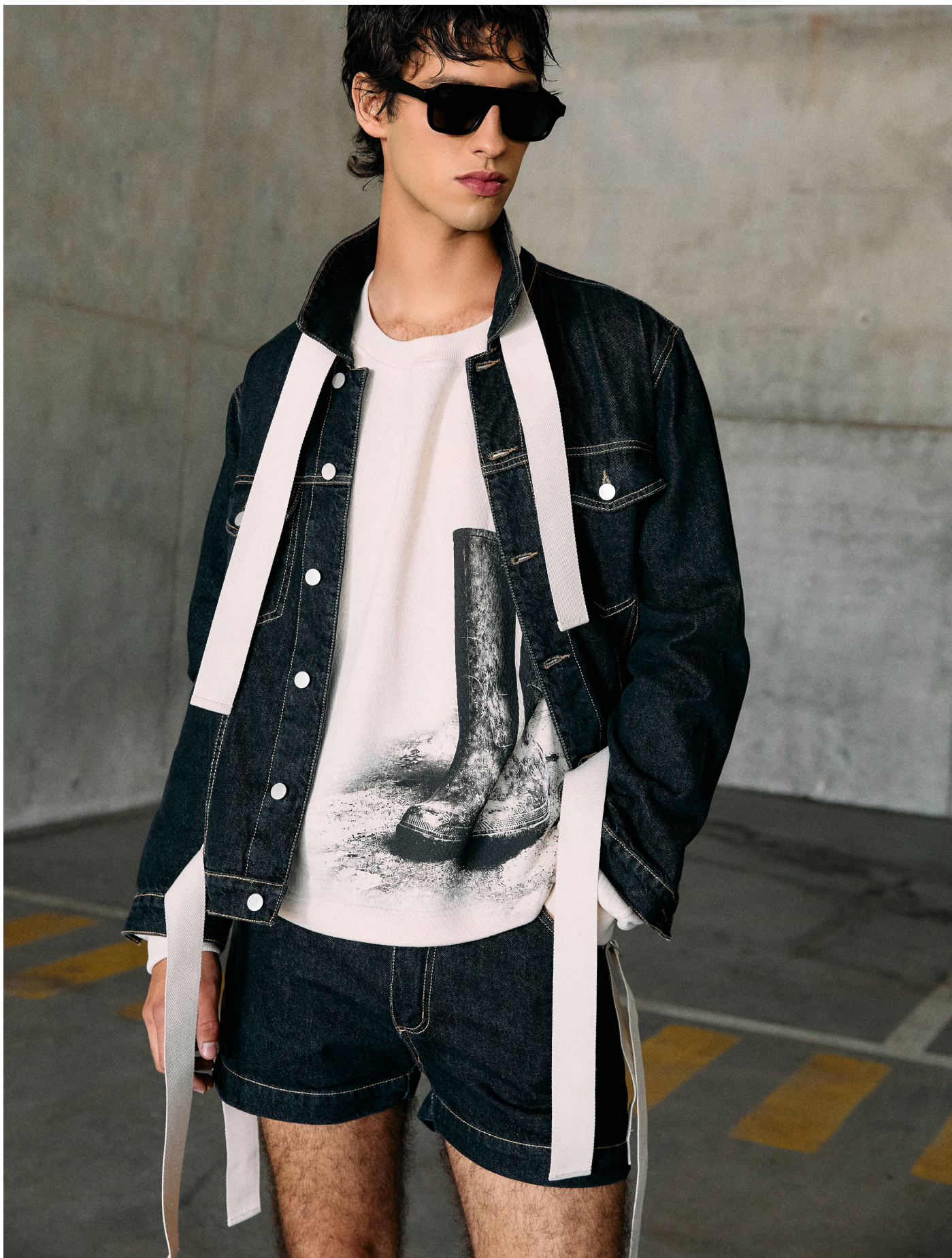
Glasses | DCSS27-GLASSES01 | Black Trucker | DCSS27-OUTWEAR-JEANS02 | Black Sweatshirt | DCSS27-SWEATSHIRTO4 | Ecrú Shorts | DCASS27-SHORT-JEANS01 | Black