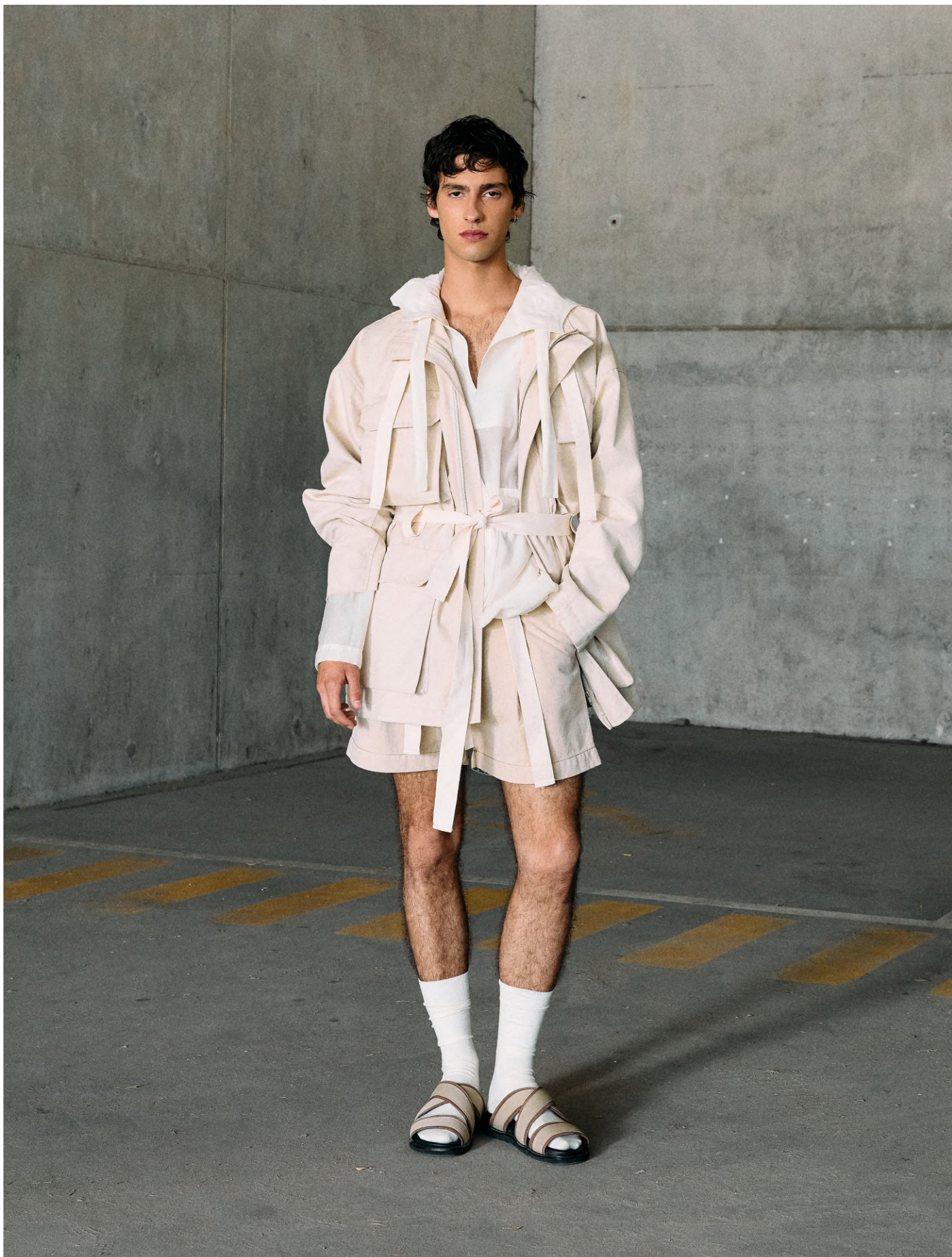
Parka | DCSS27-PARKA03 | Beige Popover | DCSS27-OUTWEAR03 | Ecru Shorts | DCSS27-SHORT-JEANS08 | Beige Sandals | DCSS27-SHOES01 | Beige