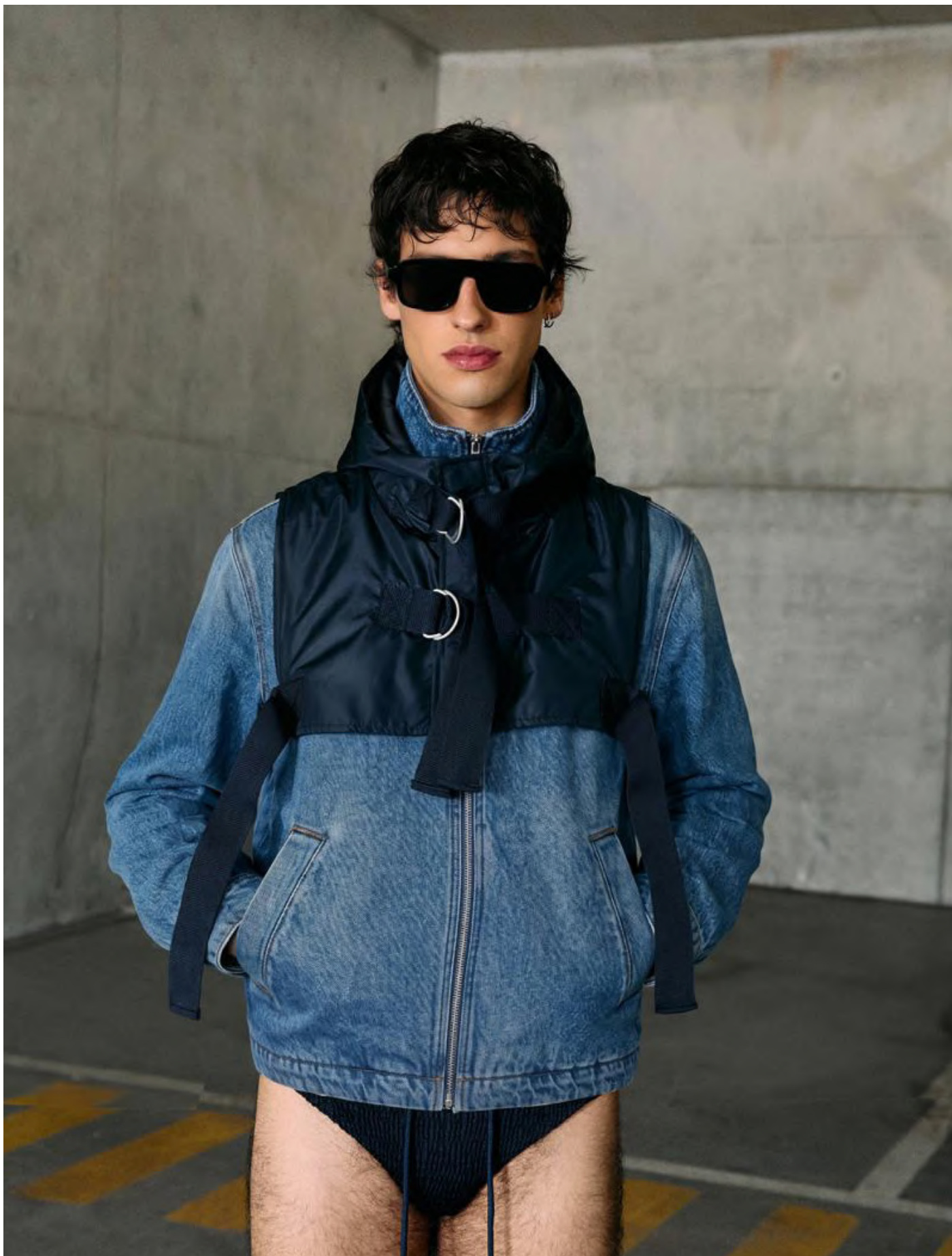
Glasses | DCSS27-GLASSES01 | Gray Vest | DCSS27-VEST02 | Marine Jacket | DCSS27-OUTWEAR-JEANS05 | Marine Swim Trunks | DCSS27-SWIMWEAR03 | Marine