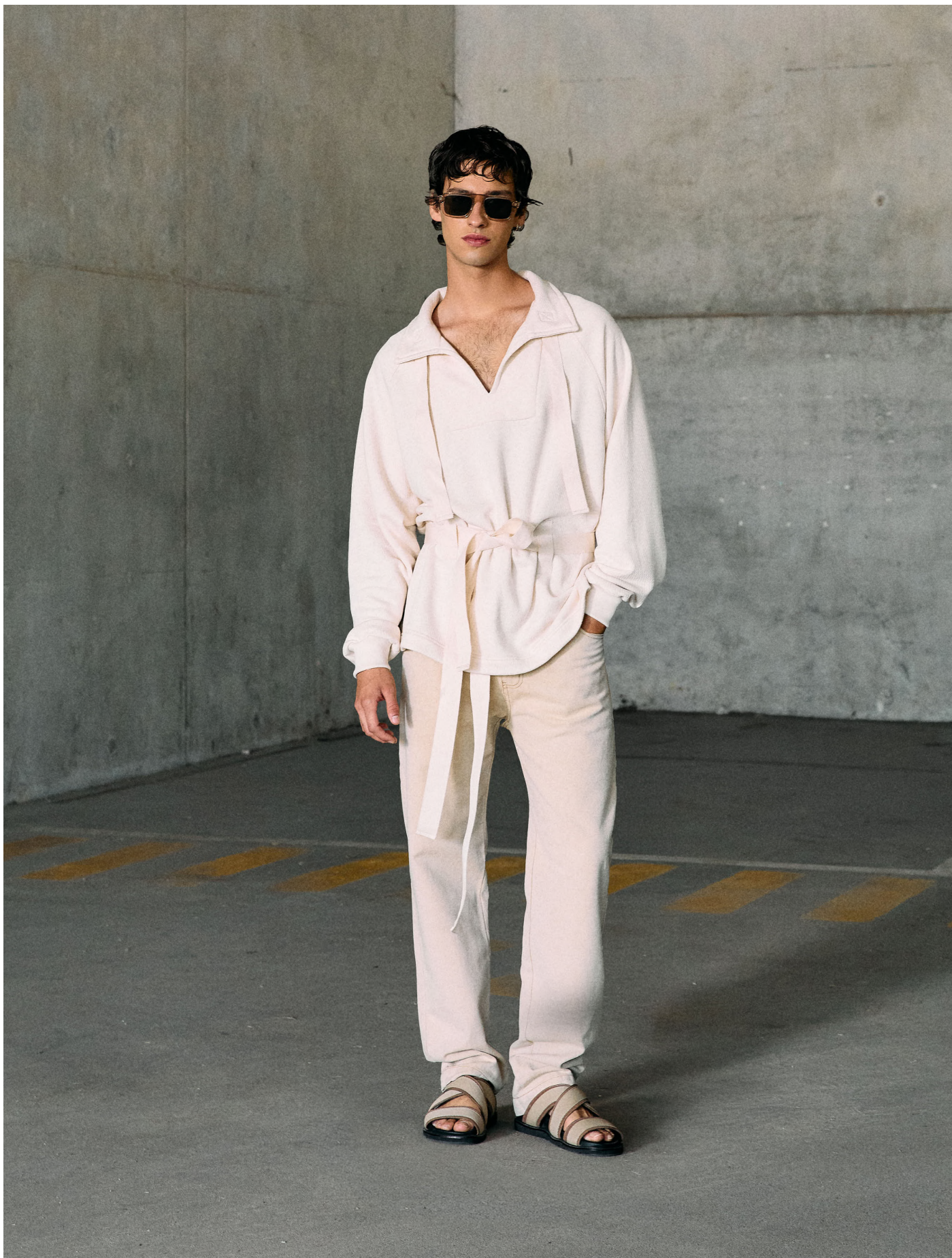
Glasses | DCSS27-GLASSES01 | Beige Sweatshirt | DCSS27-SWEATSHIRTO3 | Ecrú Jeans | DCSS27-JEANS03 | Beige Sandals | DCSS27-SHOES01 | Beige