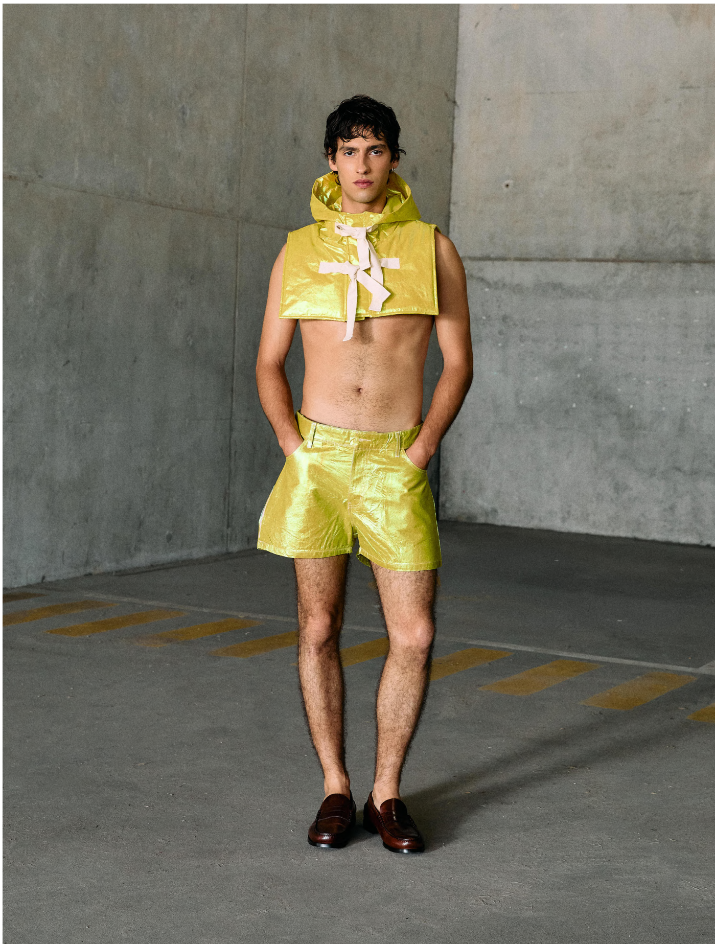
Vest | DCASS27-VEST | Yellow Iris Shorts | DCASS27-SHORT-JEANS04 | Yellow Iris Moccassins | DCSS27-SHOES03 | Brown