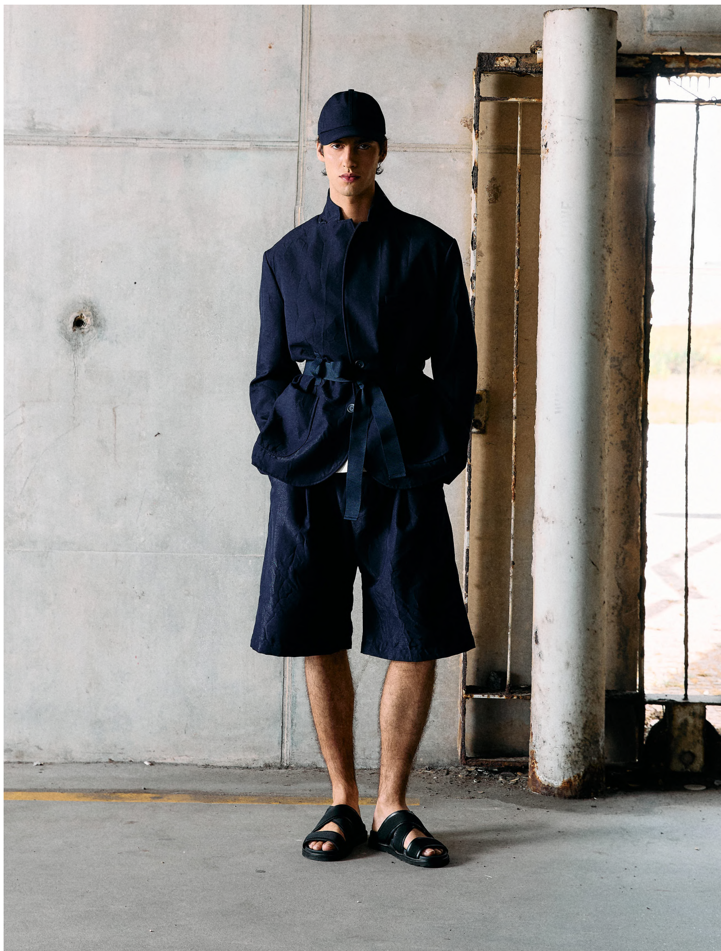
Cap | DCSS27-CAP02 | Marine Blazer | DCSS27-BLAZER03 | Marine Singlet | DCASS27-SINGLET07 | Ecrú Jorts | DCASS27-SHORT04 | Marine Sandals | DCSS27-SHOES01 | Black