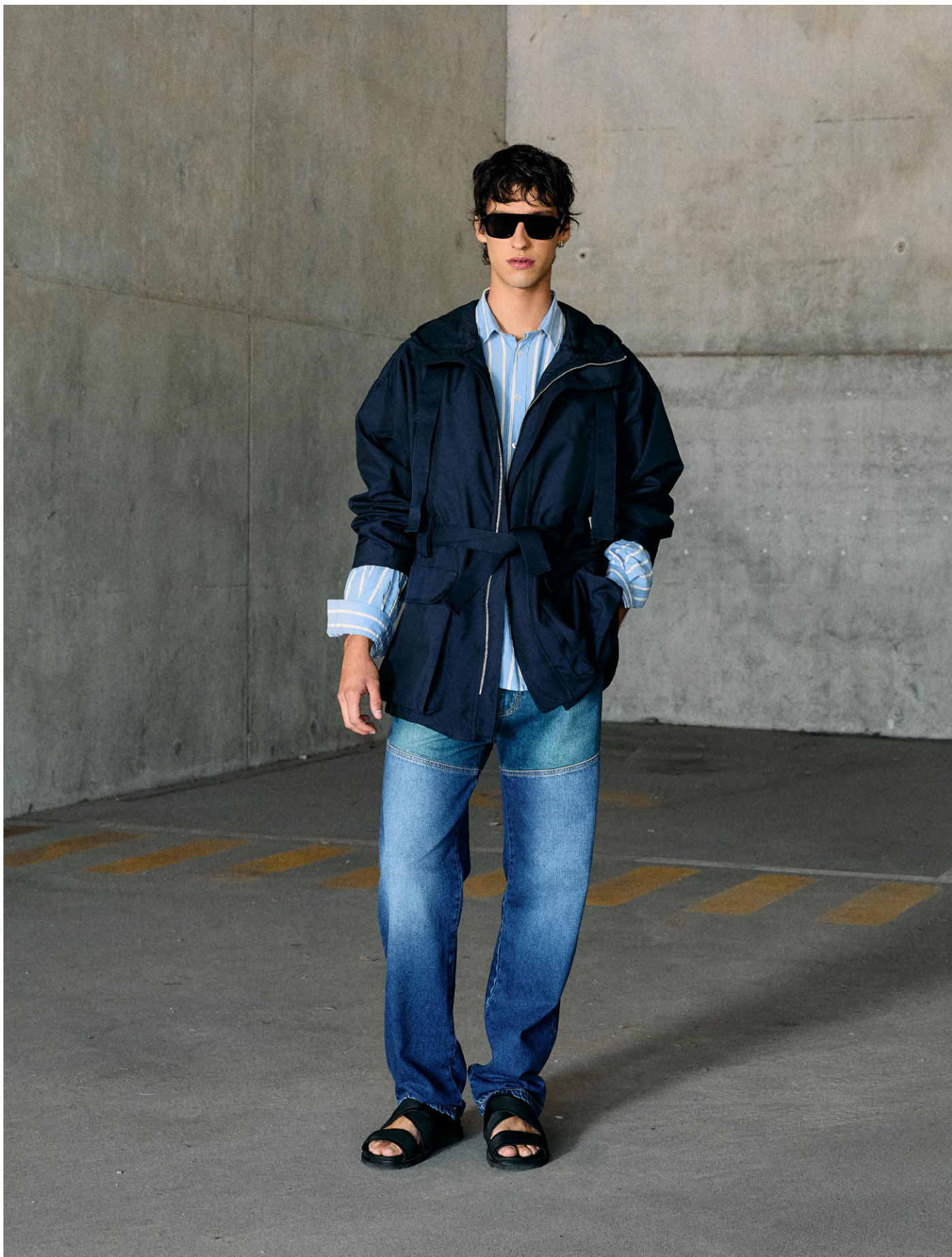
Glasses | DCSS27-GLASSES01 | Black Parka | DCSS27-PARKA04 | Marine Shirt | DCSS27-SHIRT04 | Blue / Yellow / White Jeans | DCSS27-JEANS01 | Dirty Blue Sandals | DCSS27-SHOES01 | Black