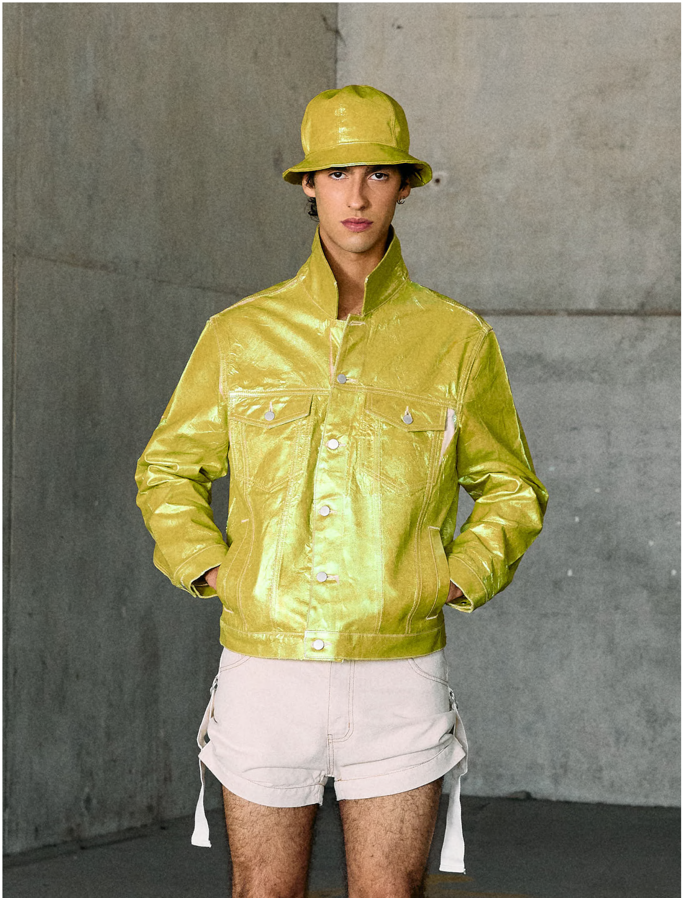
Hat | DCSS27-HAT01 | Yellow Iris Trucker | DCSS27-OUTWEAR-JEANS01 | Yellow Iris Shorts | DCASS27-SHORT-JEANS03 | Beige