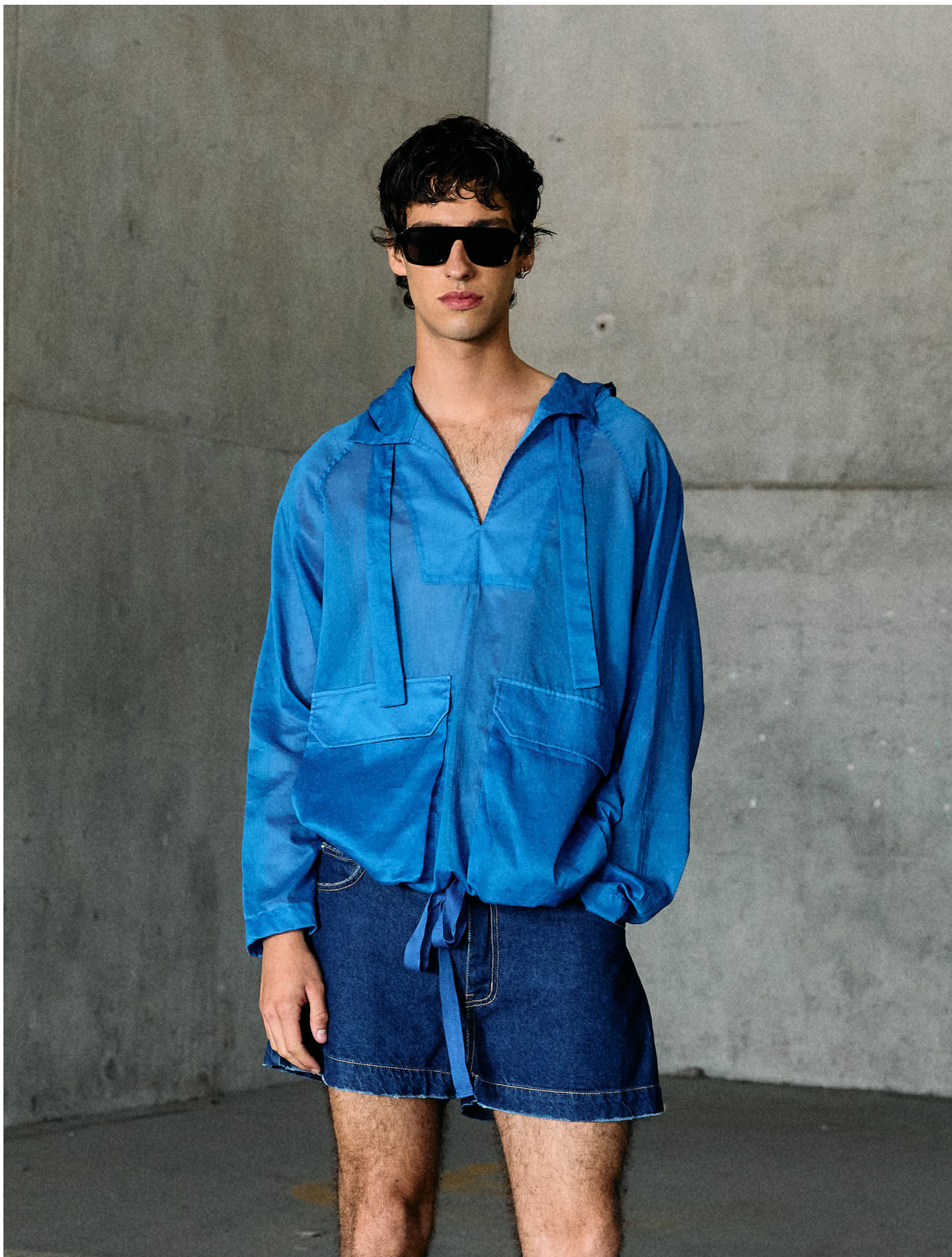
Glasses | DCSS27-GLASSES01 | Black Popover | DCSS27-OUTWEAR02 | Blue Shorts | DCASS27-SHORT-JEANS06 | Marine