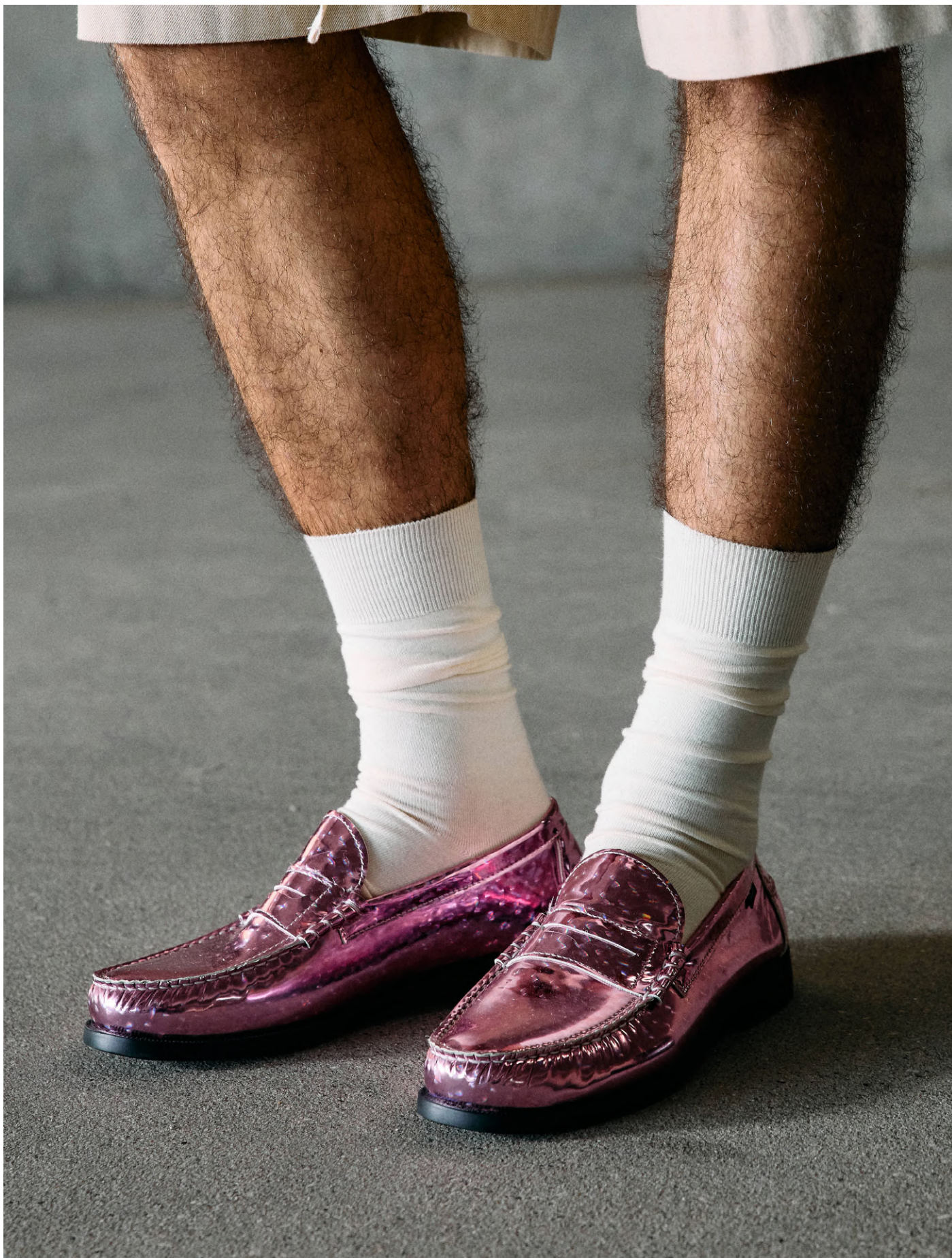
Shorts | DCASS27-SHORT-JEANS08 | Beige Moccassins | DCASS27-SHOES01 | Holo Pink