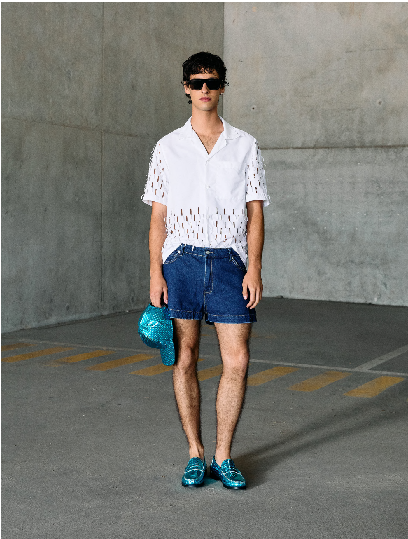
Glasses | DCSS27-GLASSES01 | Black Shirt | DCSS27-SHIRT07 | White Shorts | DCASS27-SHORT-JEANS06 | Marine Cap | DCSS27-CAPO3 | Holo Blue Moccassins| DCSS27-SHOES02 | Holo Blue