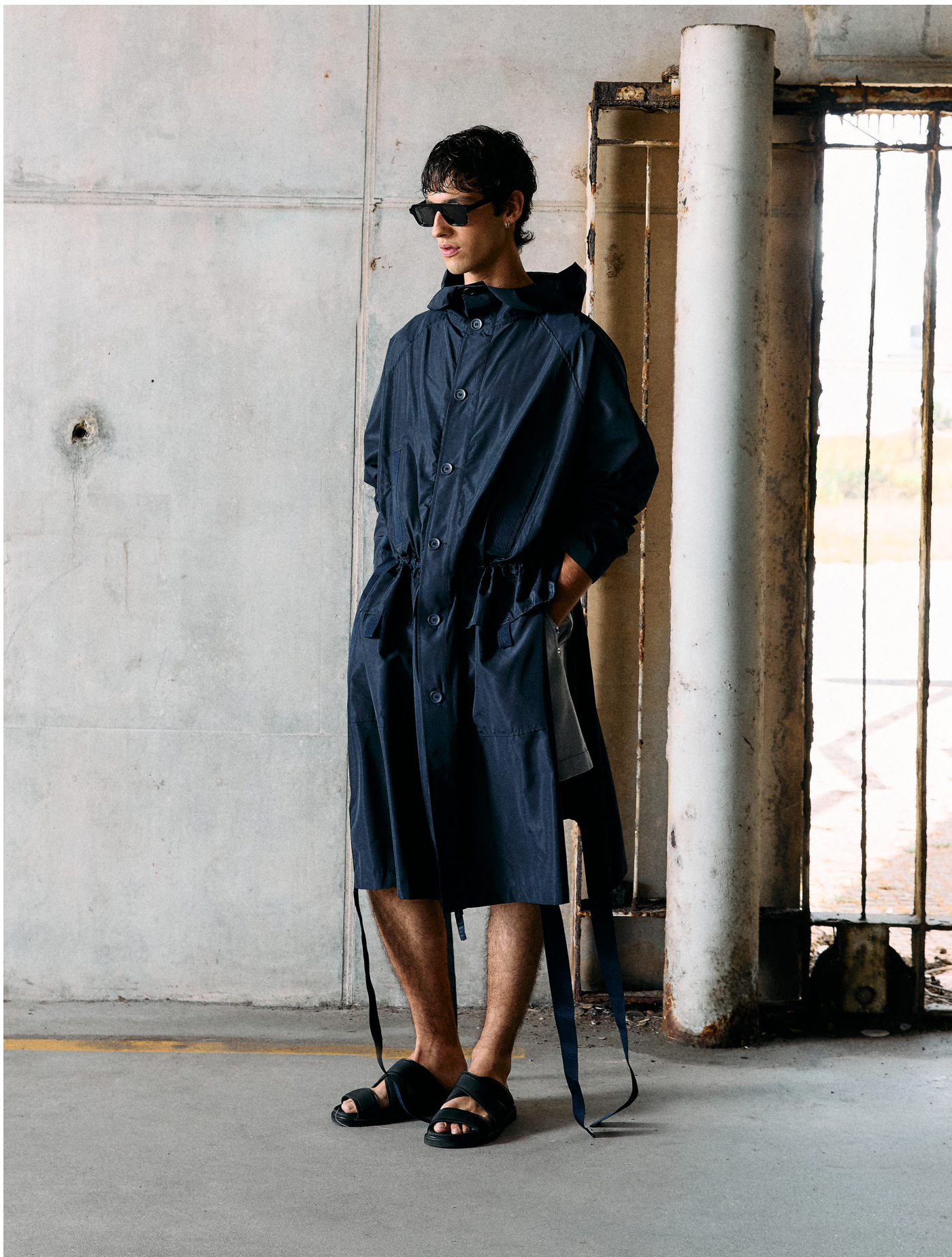
Glasses | DCSS27-GLASSES01 | Black Parka | DCSS27-PARKA02 | Marine Shorts | DCASS27-SHORT-JEANS07 | Blue Sandals | DCSS27-SHOES01 | Black