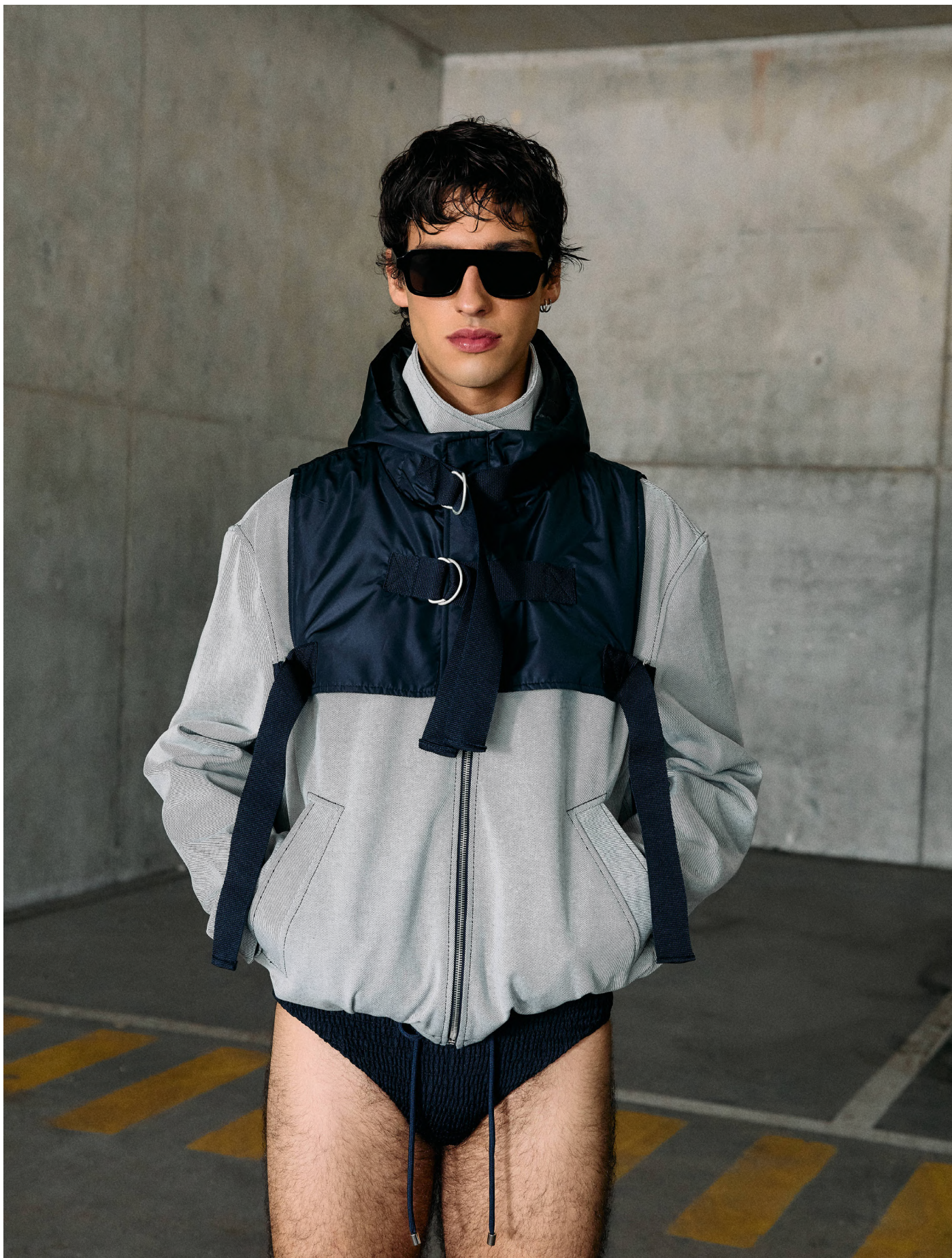
Glasses | DCSS27-GLASSES01 | Gray Vest | DCSS27-VEST02 | Marine Jacket | DCSS27-OUTWEAR-JEANS06 | Blue Swim Trunks | DCSS27-SWIMWEAR03 | Marine