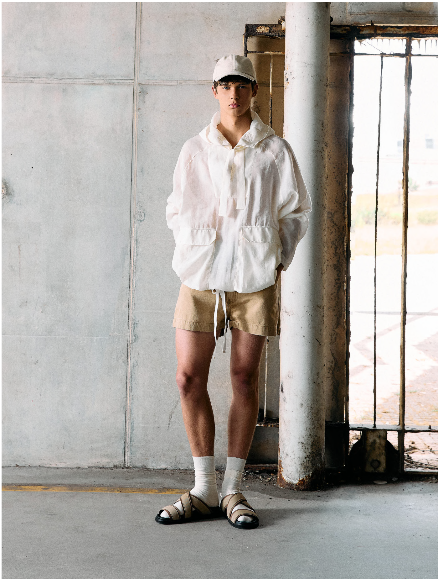
Cap | DCSS27-CAP01 | Beige Popover | DCSS27-OUTWEAR03 | E cru Shorts | DCSS27-SHORT-JEANS05 | Beige Sandals | DCSS27-SHOES01 | Beige