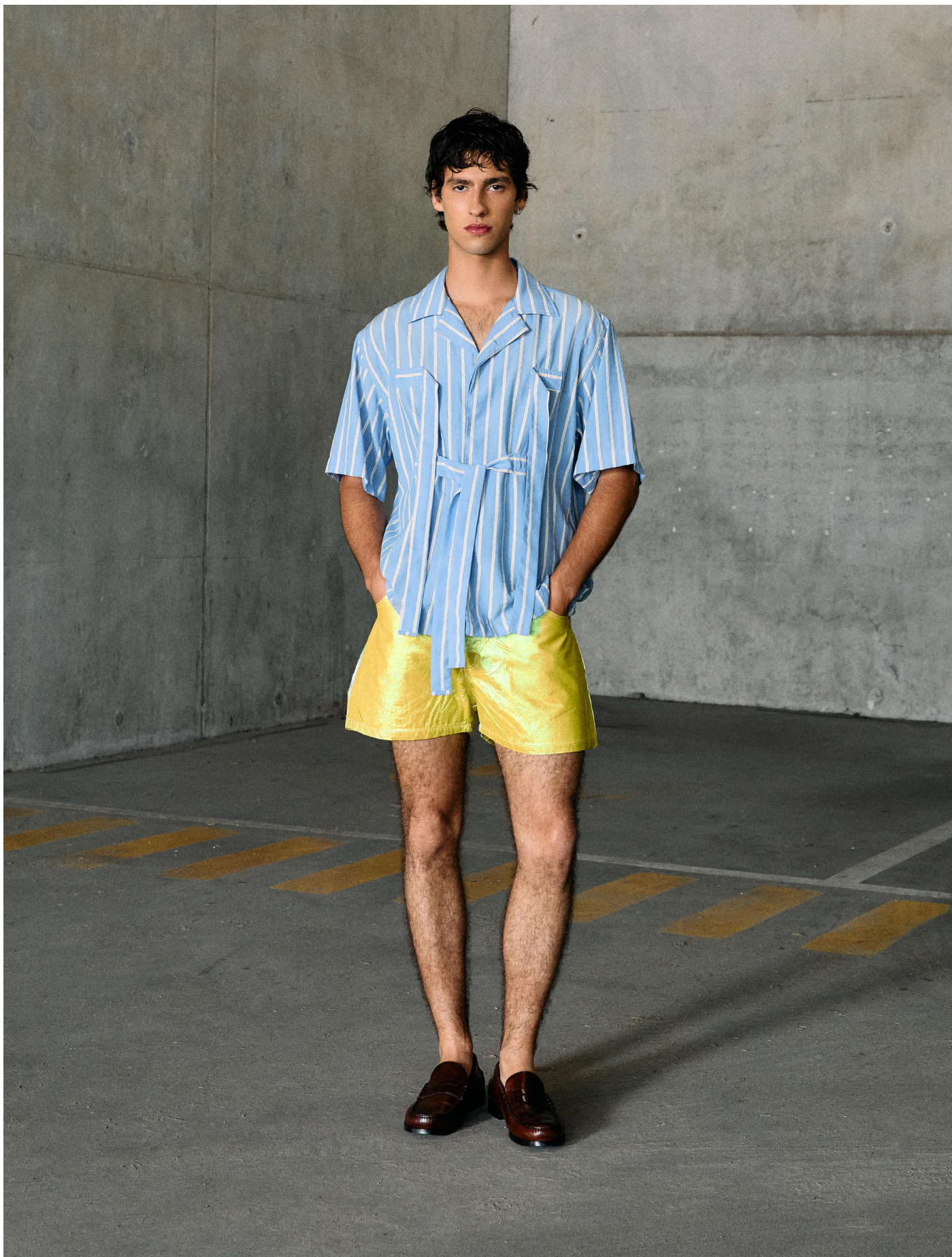
Shirt | DCSS27-SHIRT10 | Blue / Yellow / White Shorts | DCASS27-SHORT-JEANSO4 | Yellow Iris Moccassins | DCSS27-SHOES03 | Brown