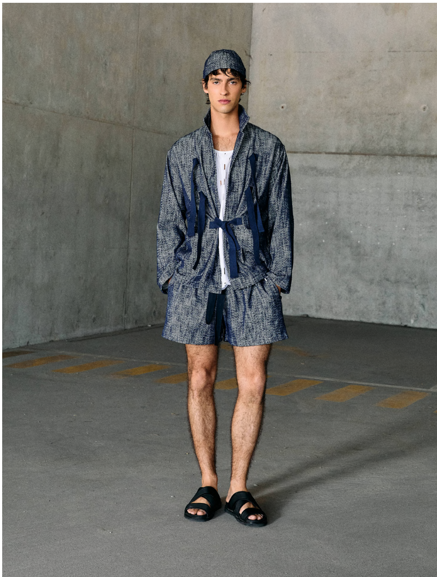
Sailor Cap | DCSS27-SAILORCAP01 | Marine / White Overshirt | DCSS27-OVERSHIRTO4 | Marine / White Singlet | DCASS27-SINGLETO2 | White Shorts | DCASS27-SHORT02 | Marine / White Sandals | DCSS27-SHOES01 | Black