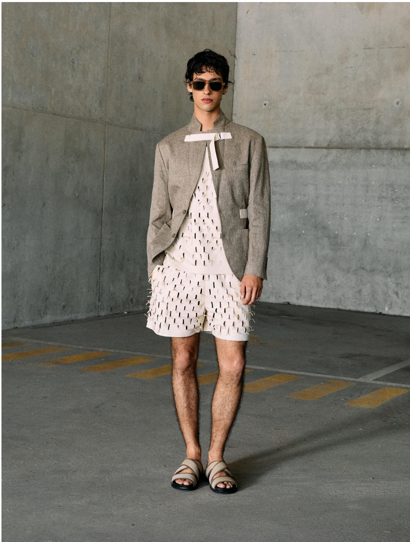
Glasses | DCSS27-GLASSES01 | Beige Blazer | DCSS27-BLAZER02 | Stone Singlet | DCASS27-SINGLET01 | Beige Shorts | DCASS27-SHORT01 | Beige Sandals | DCSS27-SHOES01 | Beige