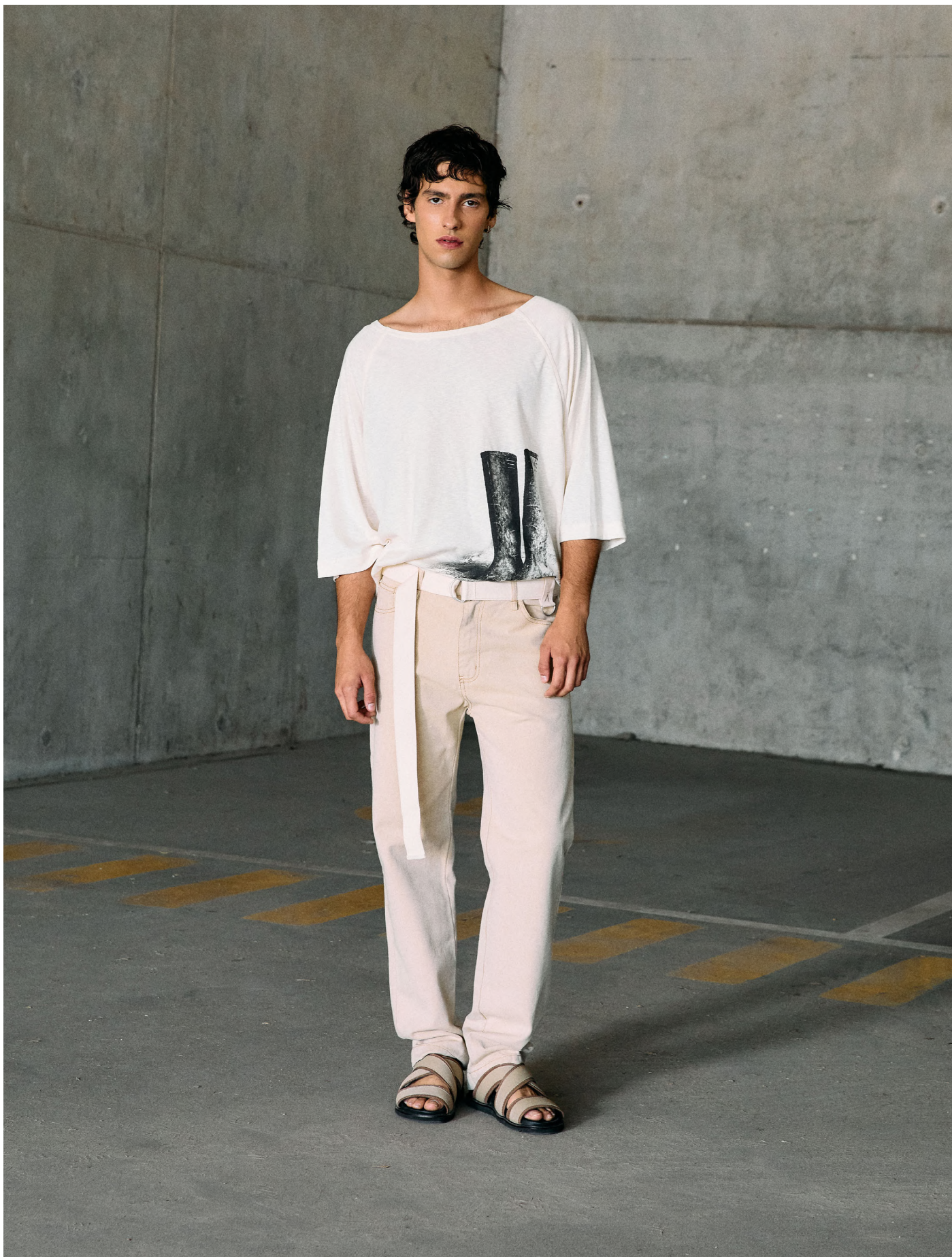
T-shirt | DCSS27-T-SHIRTO4 | E cru Jeans | DCSS27-JEANS03 | Beige Sandals | DCSS27-SHOES01 | Beige