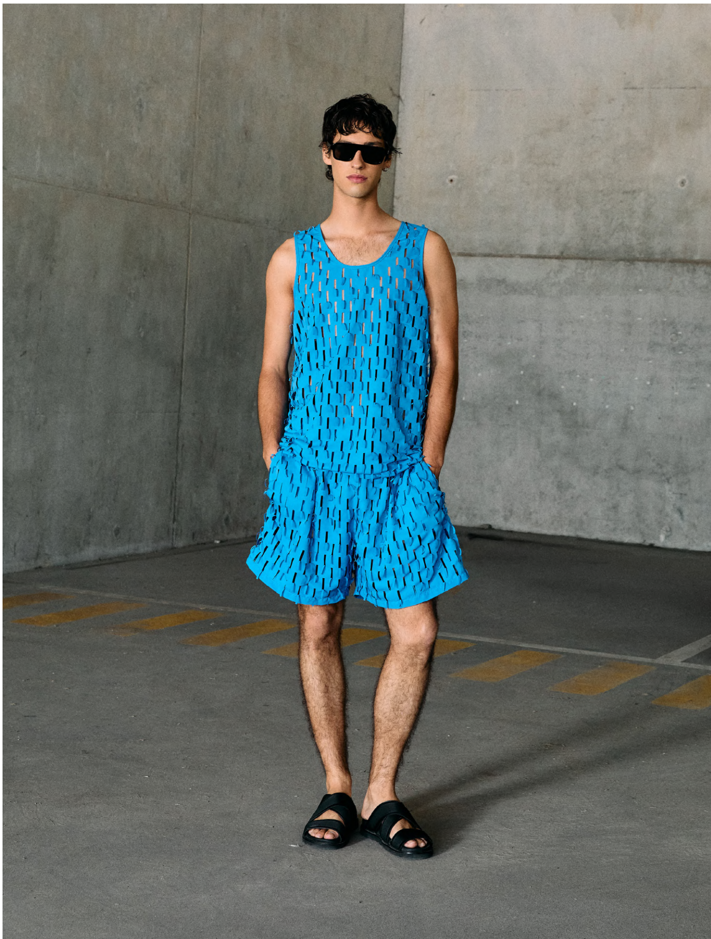
Glasses | DCSS27-GLASSES01 | Black Singlet | DCASS27-SINGLETO2 | Royal Blue Shorts | DCSS27-SWIMWEAR01 | Royal Blue Sandals | DCSS27-SHOES01 | Black