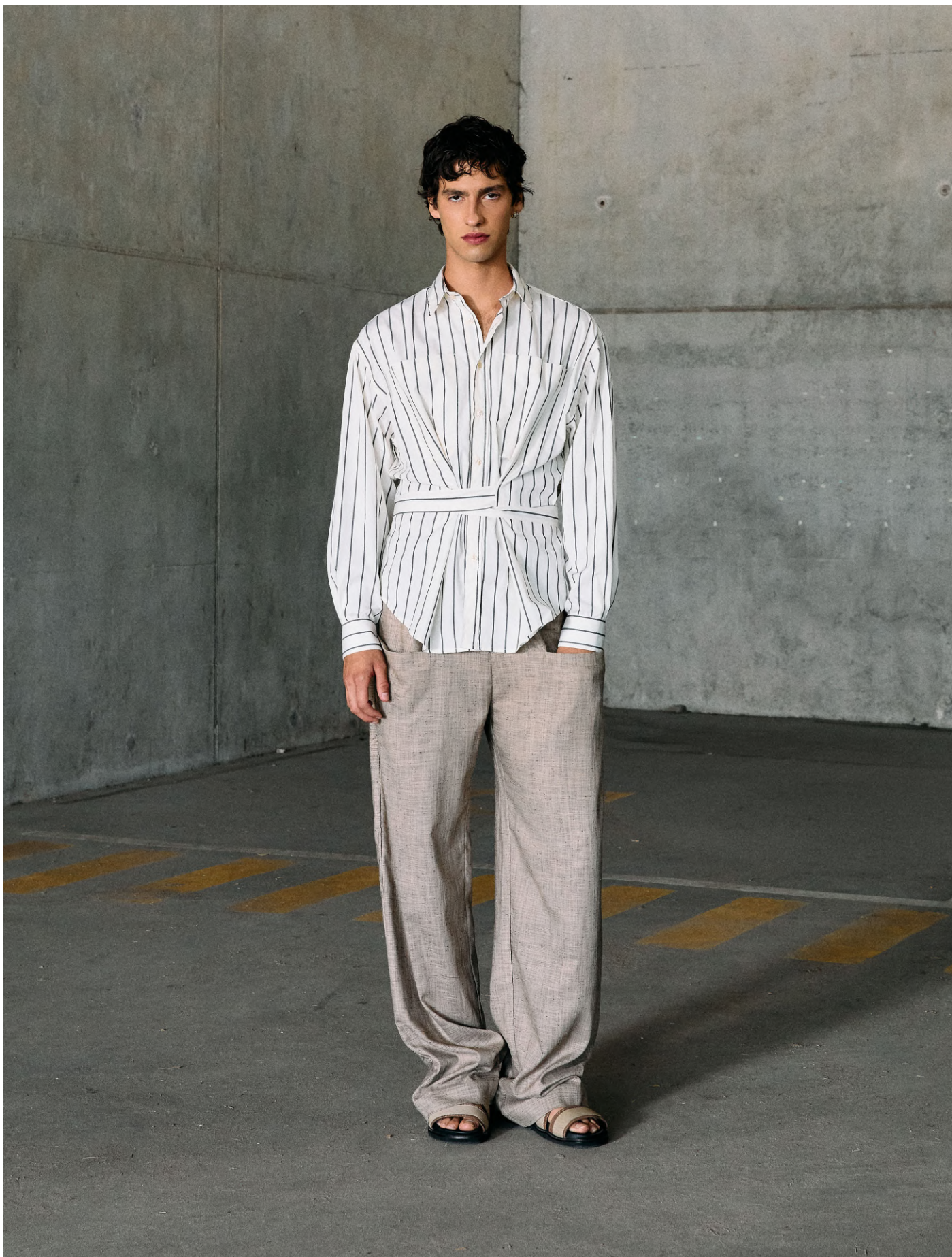
Shirt | DCSS27-SHIRT05 | Cream / Black Trousers | DCSS27-TROUSERS05 | Stone / Marine Sandals | DCSS27-SHOES01 | Beige