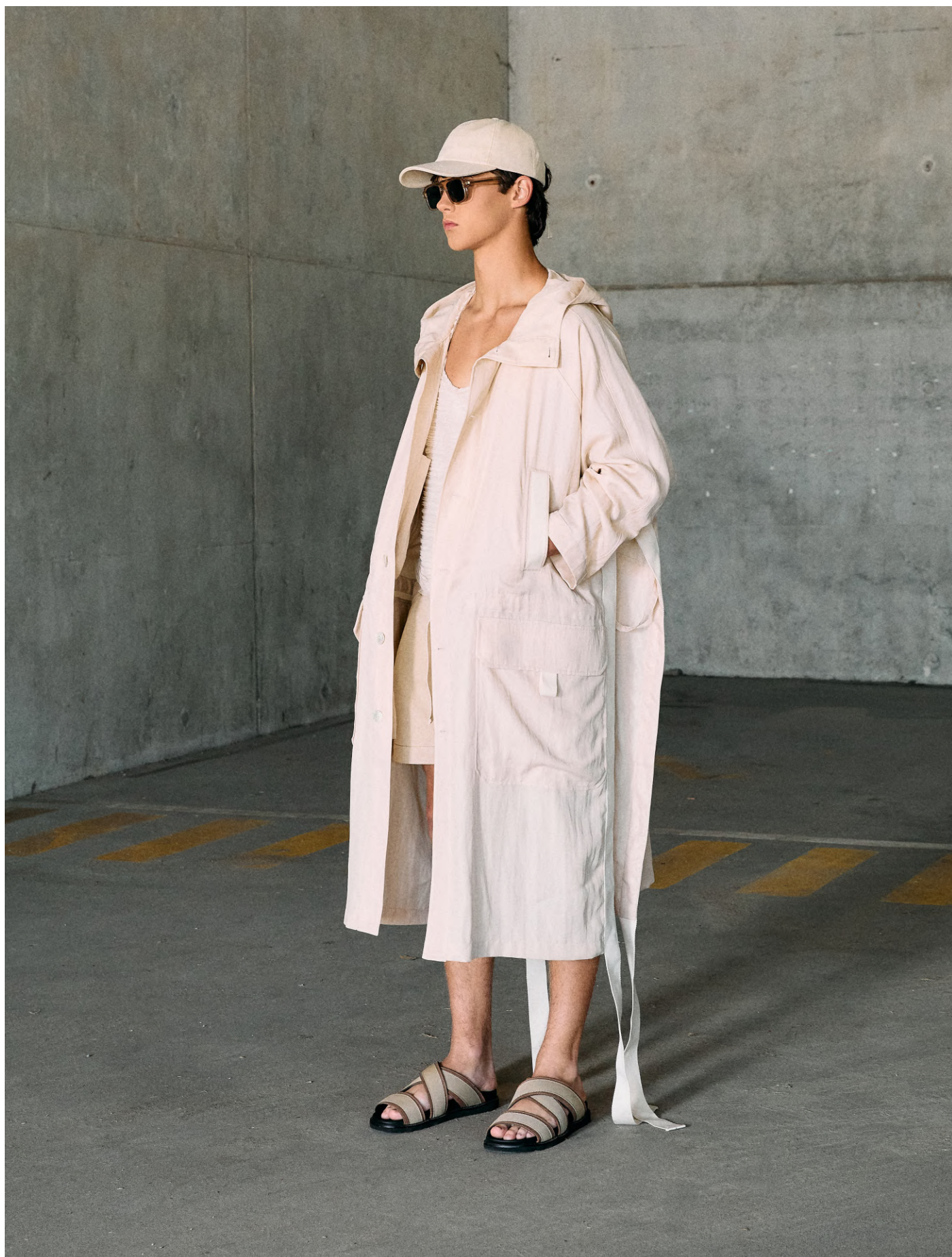
Cap | DCSS27-CAP01 | Beige Glasses | DCSS27-GLASSES01 | Beige Parka | DCSS27-PARKA01 | Beige Singlet | DCSS27-SINGLETO9 | Ecrú Sandals | DCSS27-SHOES01 | Beige