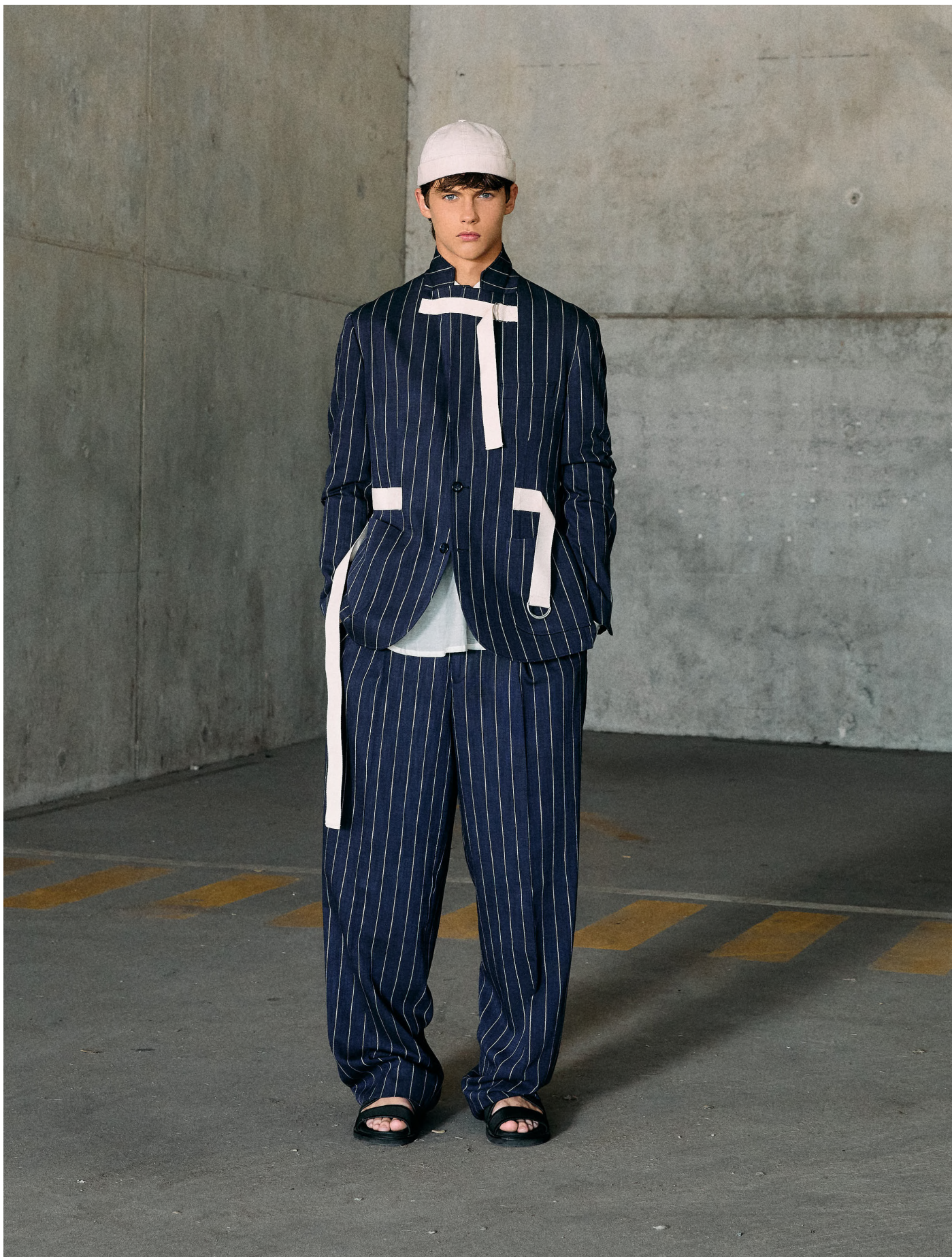
Sailor hat | DCSS27-SAILORCAPO2 | Pearl White Blazer | DCSS27-BLAZER01 | Marine / Beige Shirt | DCSS27-SHIRT03 | Ecrú Trousers | DCSS27-TROUSERS01 | Marine / Beige Sandals | DCSS27-SHOES01 | Black